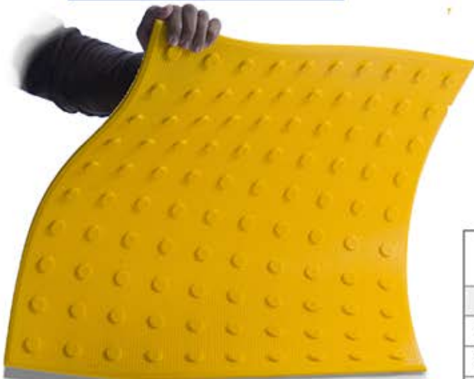
Flexible urethane material bends and conforms to slopes, curves and other irregularities.