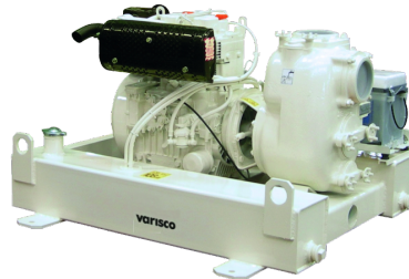
VAR 4-159 D BLOCK - E