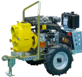
VAR 4-159 D TROLLEY - E