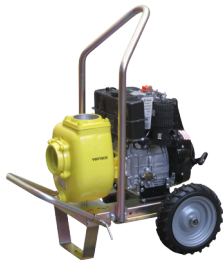
VAR 2-120 D TROLLEY - R