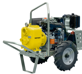
VAR 2-120 D TROLLEY - E