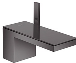
Polished Black Chrome