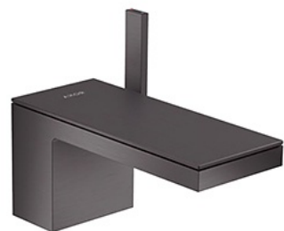
Brushed Black Chrome