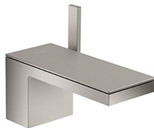
Stainless Steel Optic

*Please note that the exact look of these finishes may be altered in digital format and colours may be slightly different to what they appear to the eye.