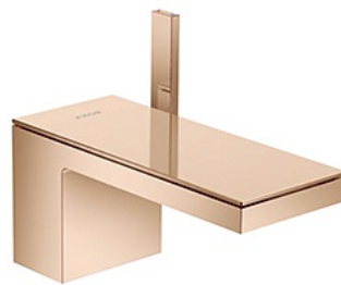
Polished Red Gold