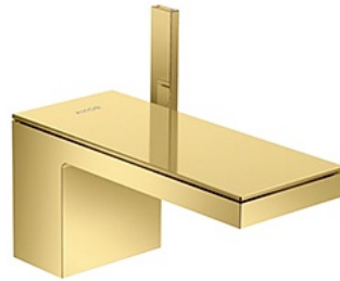
Polished Gold Optic