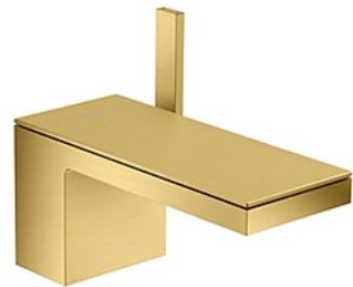
Brushed Gold Optic