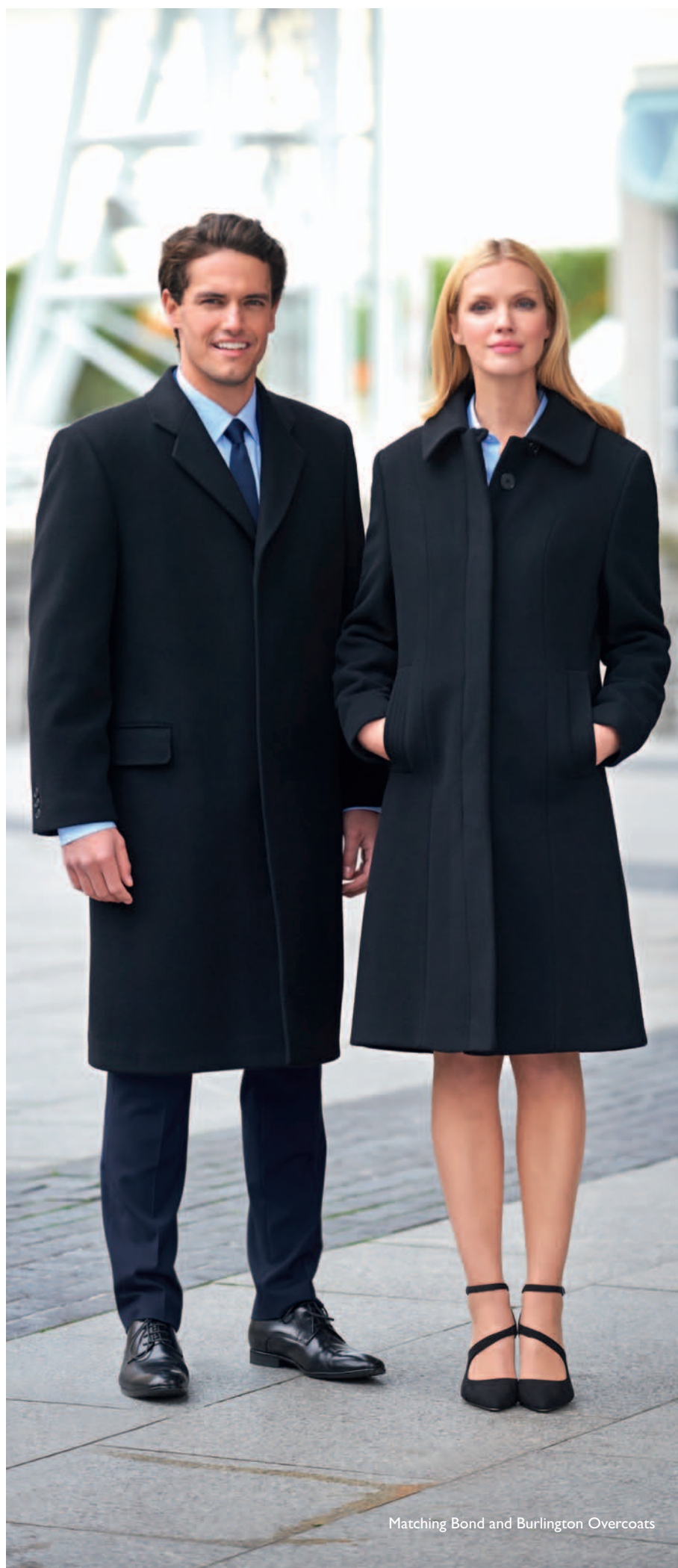
Matching Bond and Burlington Overcoats