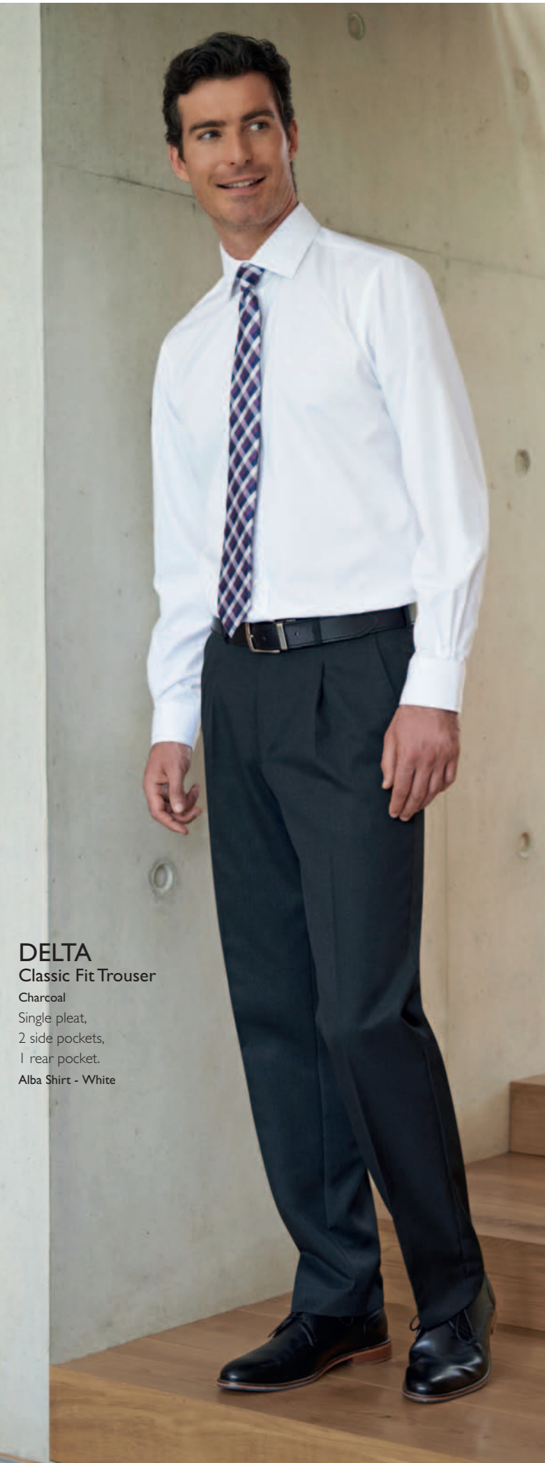
DELTA Classic Fit Trousers Charcoal Single pleat, 2 side pockets, 1 rear pocket. Alba Shirt - White