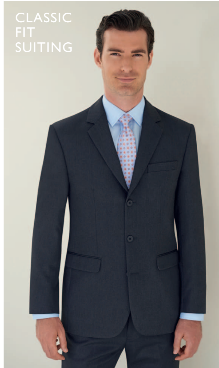
ALPHA Classic Fit Jacket Charcoal 3 button, 2 straight pockets, centre vent, 3 inside pockets. Juno Shirt - Blue