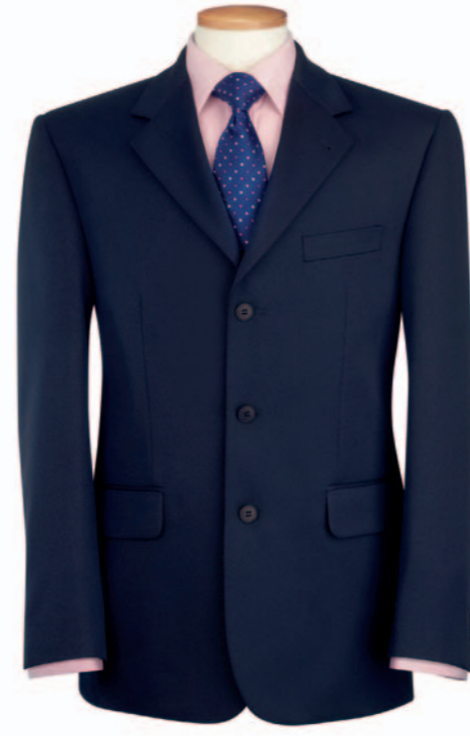
Centre back length at size 40R = 78cm

Codes & Colours: 5981A Navy 5981C Charcoal 5981D Black