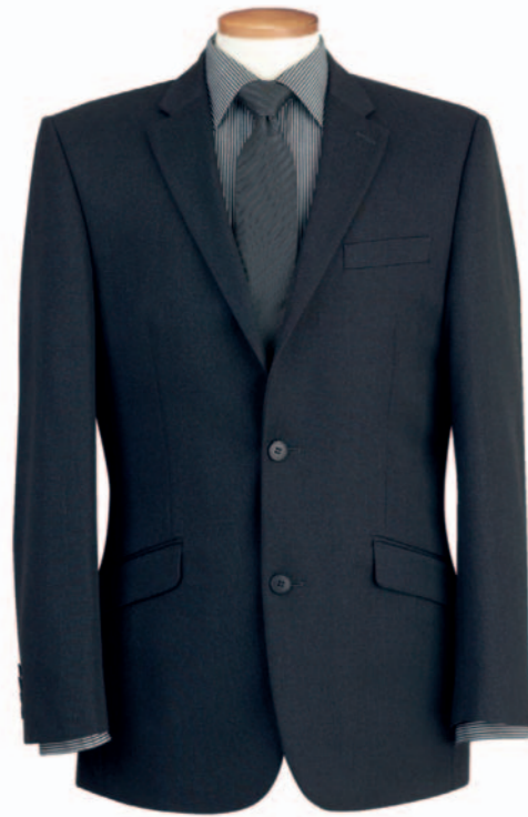
Centre back length at size 40R = 77cm

Codes & Colours: 3124A Navy 3124C Charcoal 3124D Black