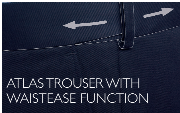
ATLAS TROUSER WITH WAISTEASE FUNCTION