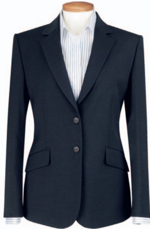
Centre back length at size 12R = 65.5cm

Sizes: 8 - 16 short 4 - 24 regular 10 - 18 long Codes & Colours: 2254A Navy 2254C Charcoal 2254D Black