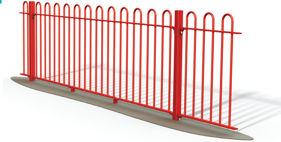
Standard Bow Top