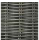
HANDWOVEN RESIN: ASH