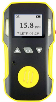
SINGLE GAS PROFESSIONAL