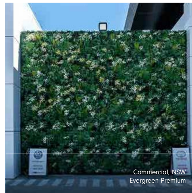
Commercial, NSW Evergreen Premium