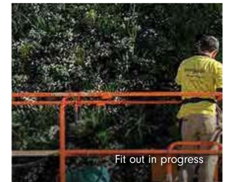
Fit out in progress