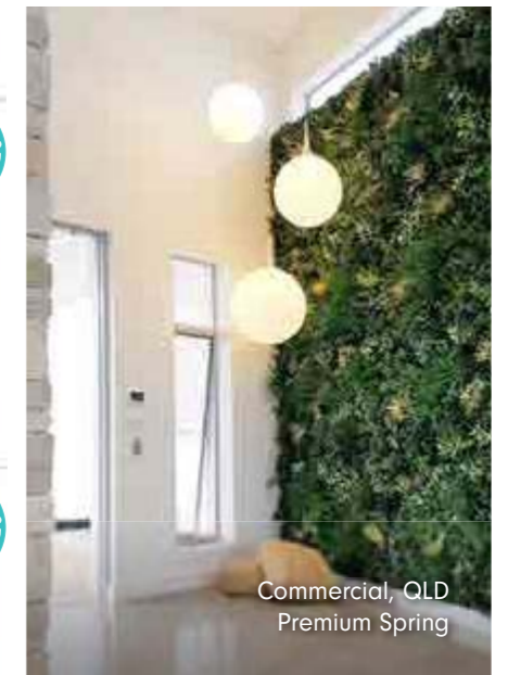
Commercial, QLD Premium Spring