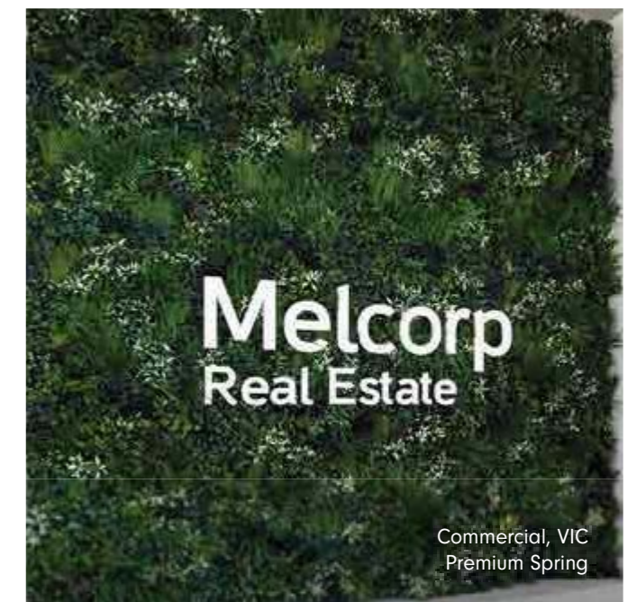
Commercial, VIC Premium Spring