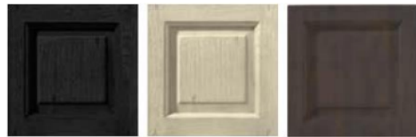
CARBONE NORDICO DARK BROWN