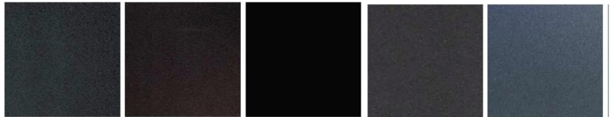
IRON SMOKE ARKANSAS IRON BLACK ANTRACITE BERING SEA