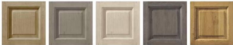
EFFETTO GREZZO GENERE QUARZO ROVERE GRIGIO NATURALE CARAMEL