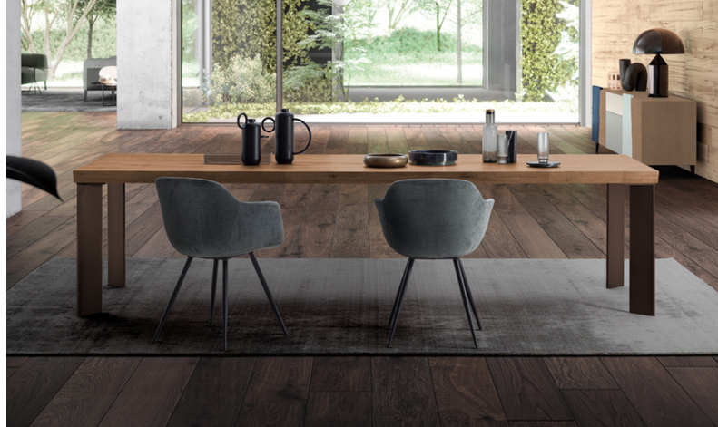
Table top can be Laser Cut or Live Edge.