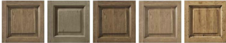
TABACCO NEBBIA HOLLAND ANTIK HOLLAND GRAY HOLLAND NATURALE