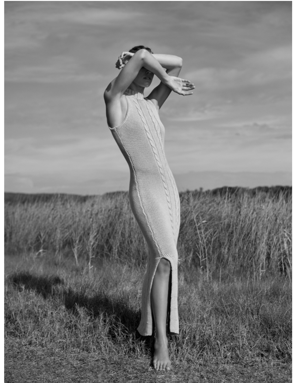
AUGUST 21 | Rebecca Cotton Cashmere Midi Knit Dress in Camel Marle