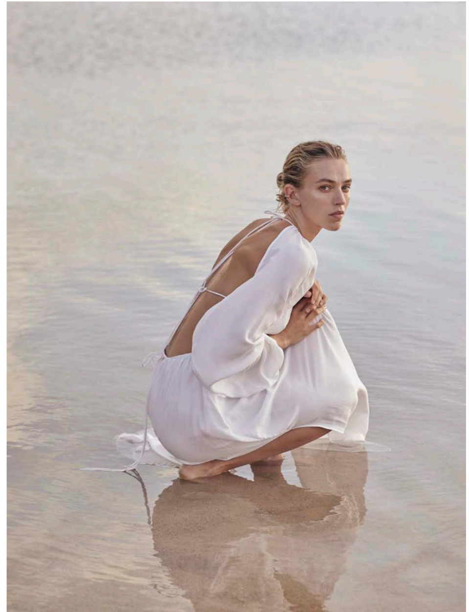
AUGUST 21 | Francis Silk Maxi Dress in Sandwash Optical White