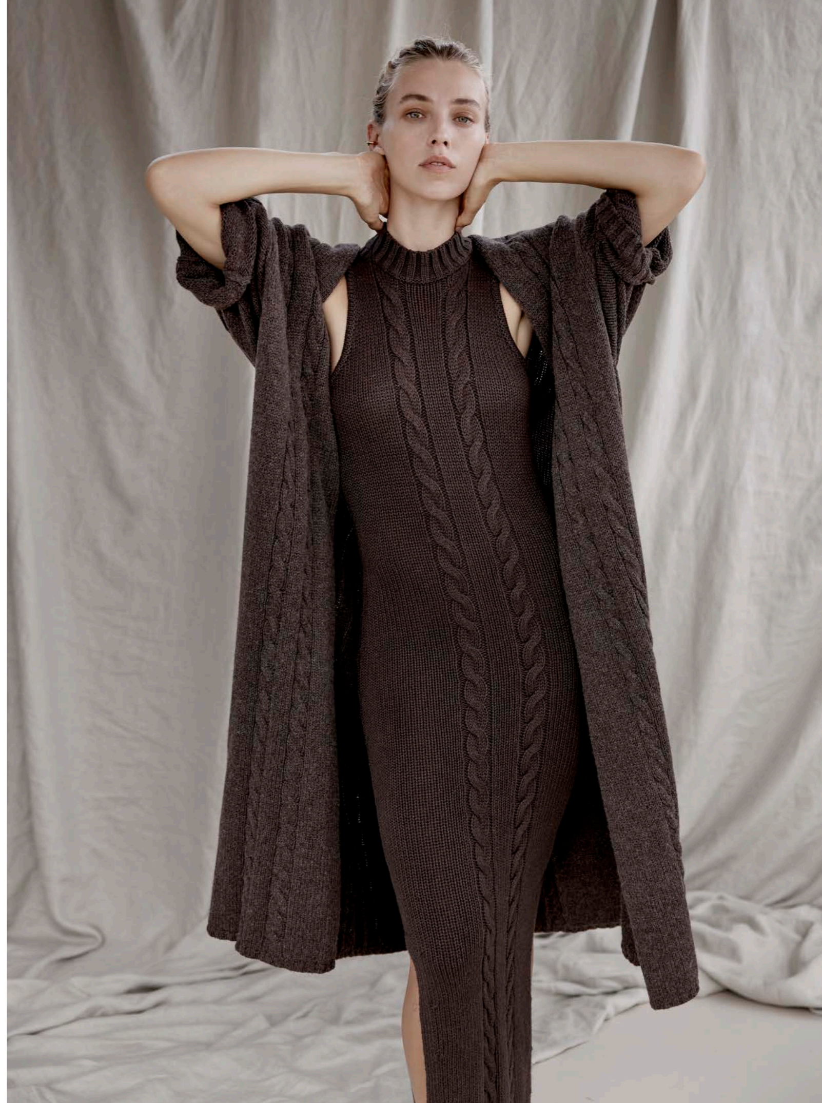
AUGUST 21 | Imogen Cotton Cashmere Knit Cardigan & Rebecca Cotton Cashmere Knit Midi Dress in Chocolate Marle