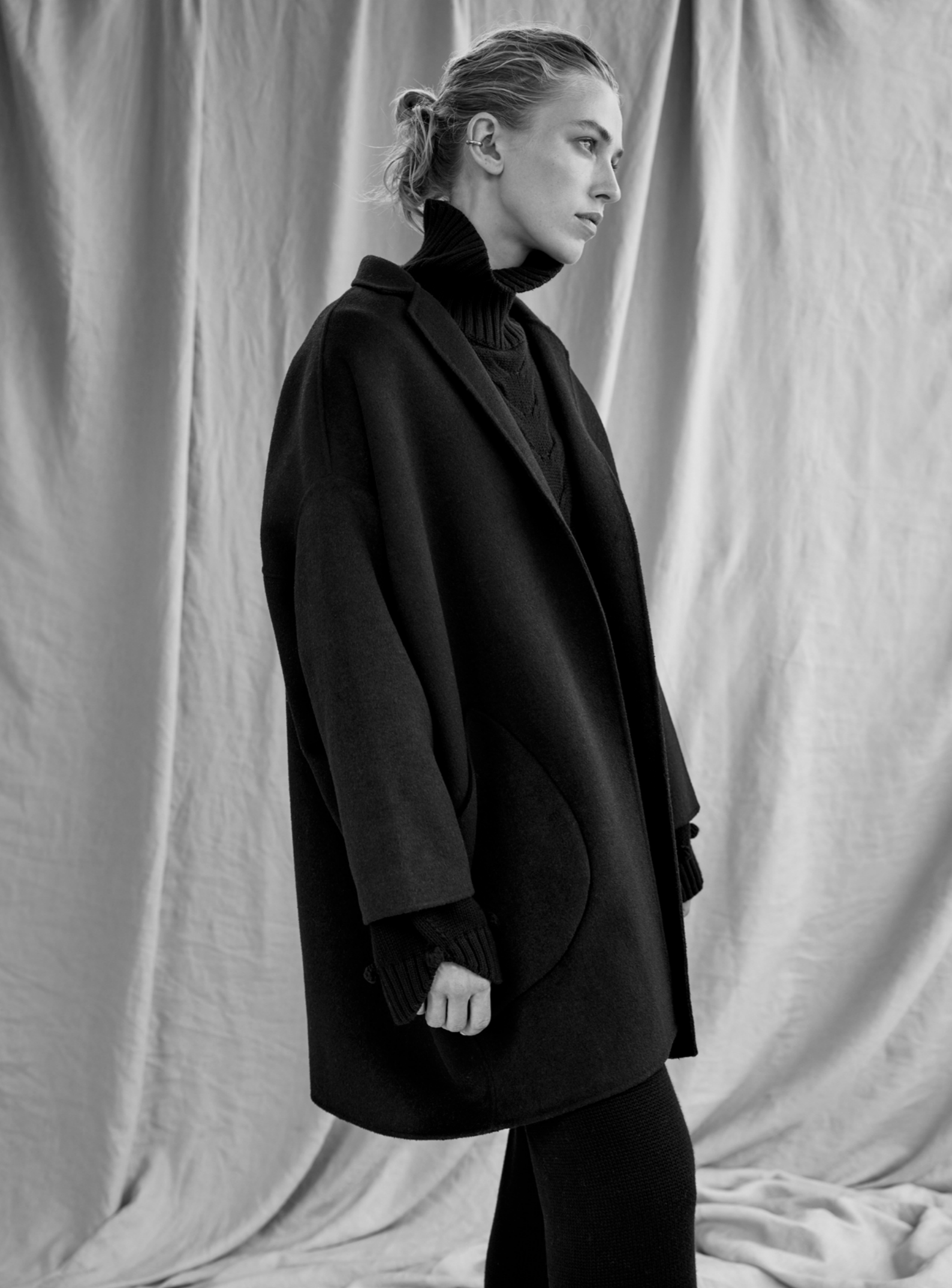
SEPTEMBER 21 | Jacinta Wool Cocoon Coat in Black