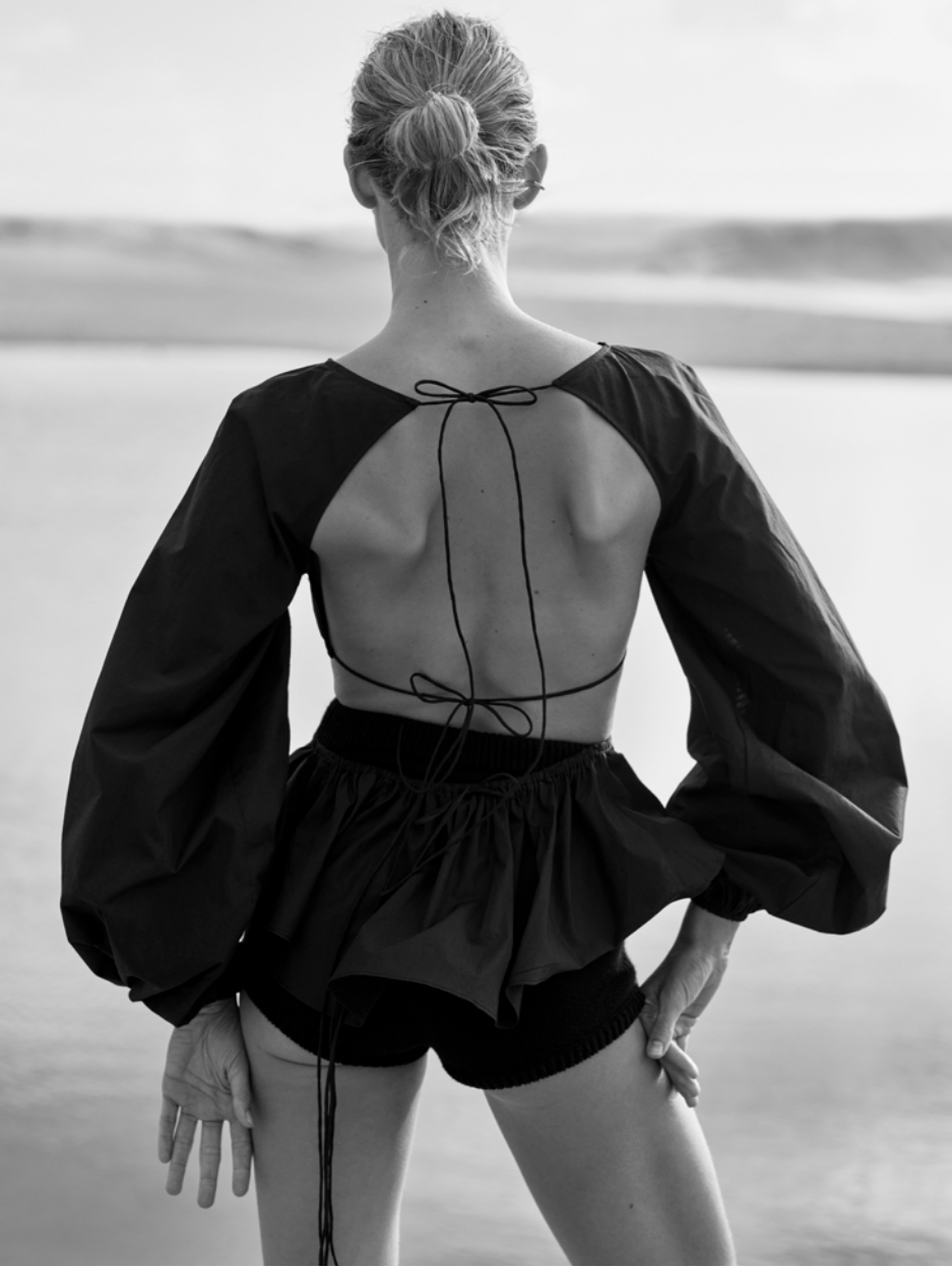
AUGUST 21 | Francis Organic Cotton Top in Navy