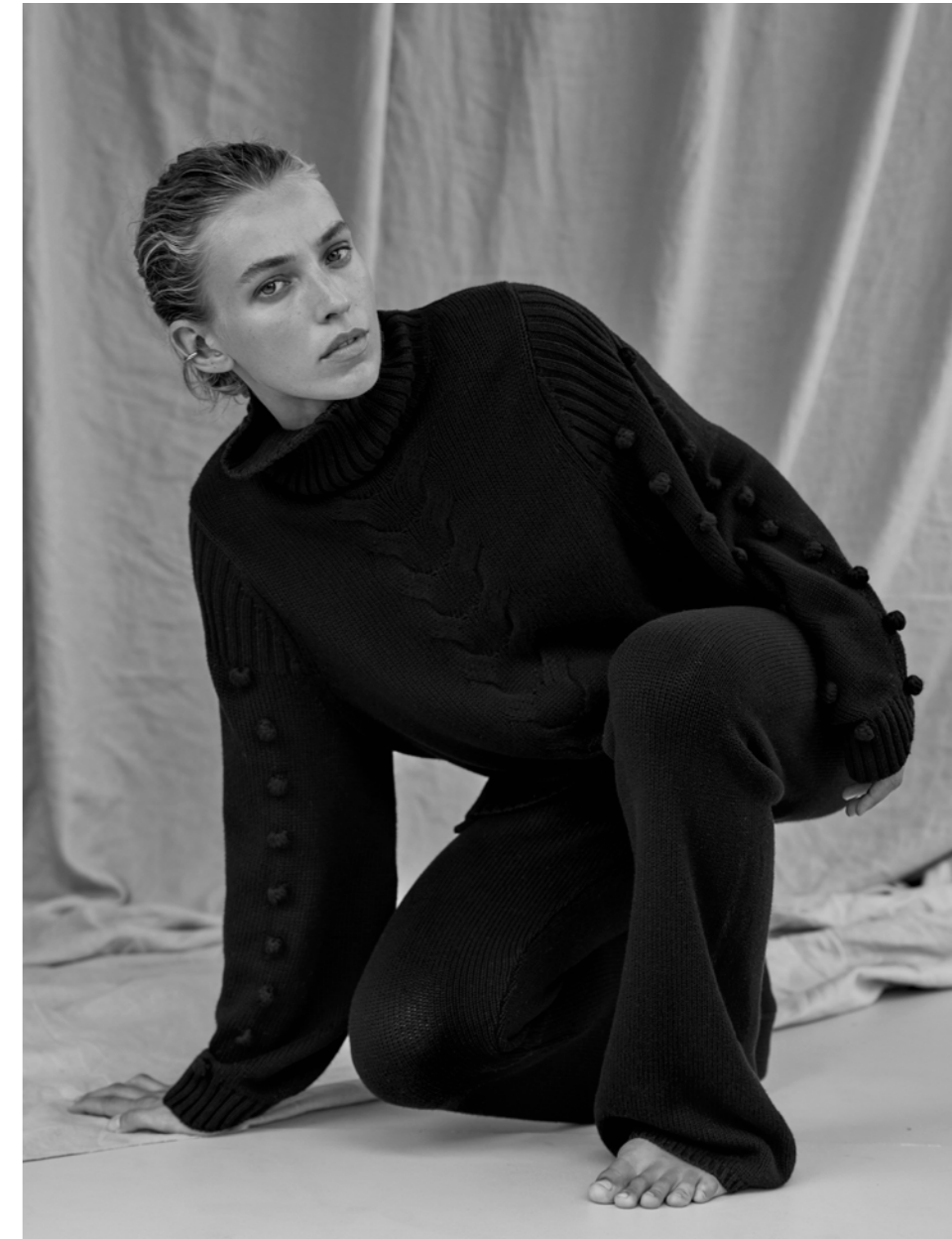
SEPTEMBER 21 | Katie Cotton Cashmere Knit & Marlowe Cotton Cashmere Knit Pant in Black