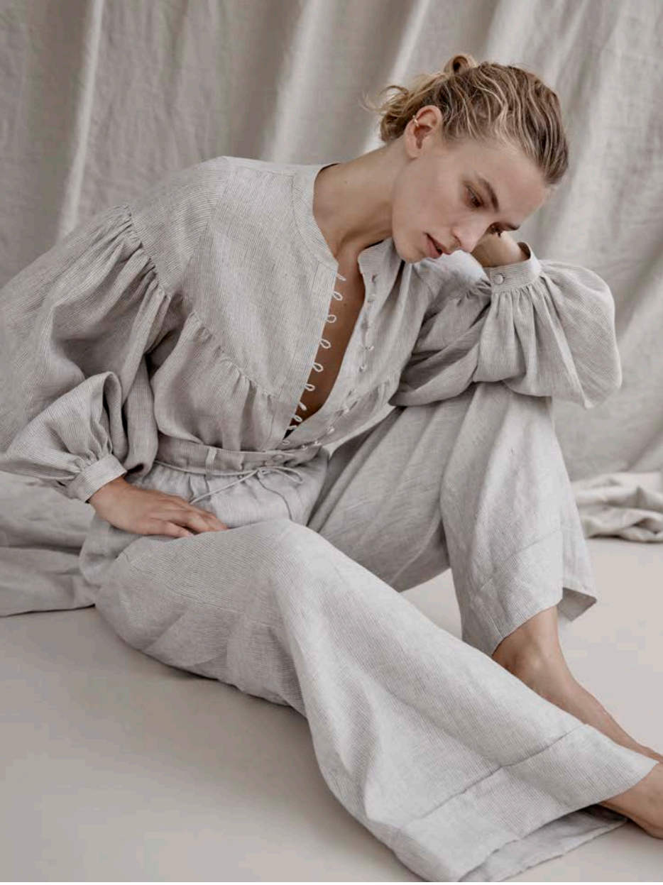
SEPTEMBER 31 | Caitlyn Linen Smock Shirt & Asha Linen Crop Pant in Black Flax Pinstripe