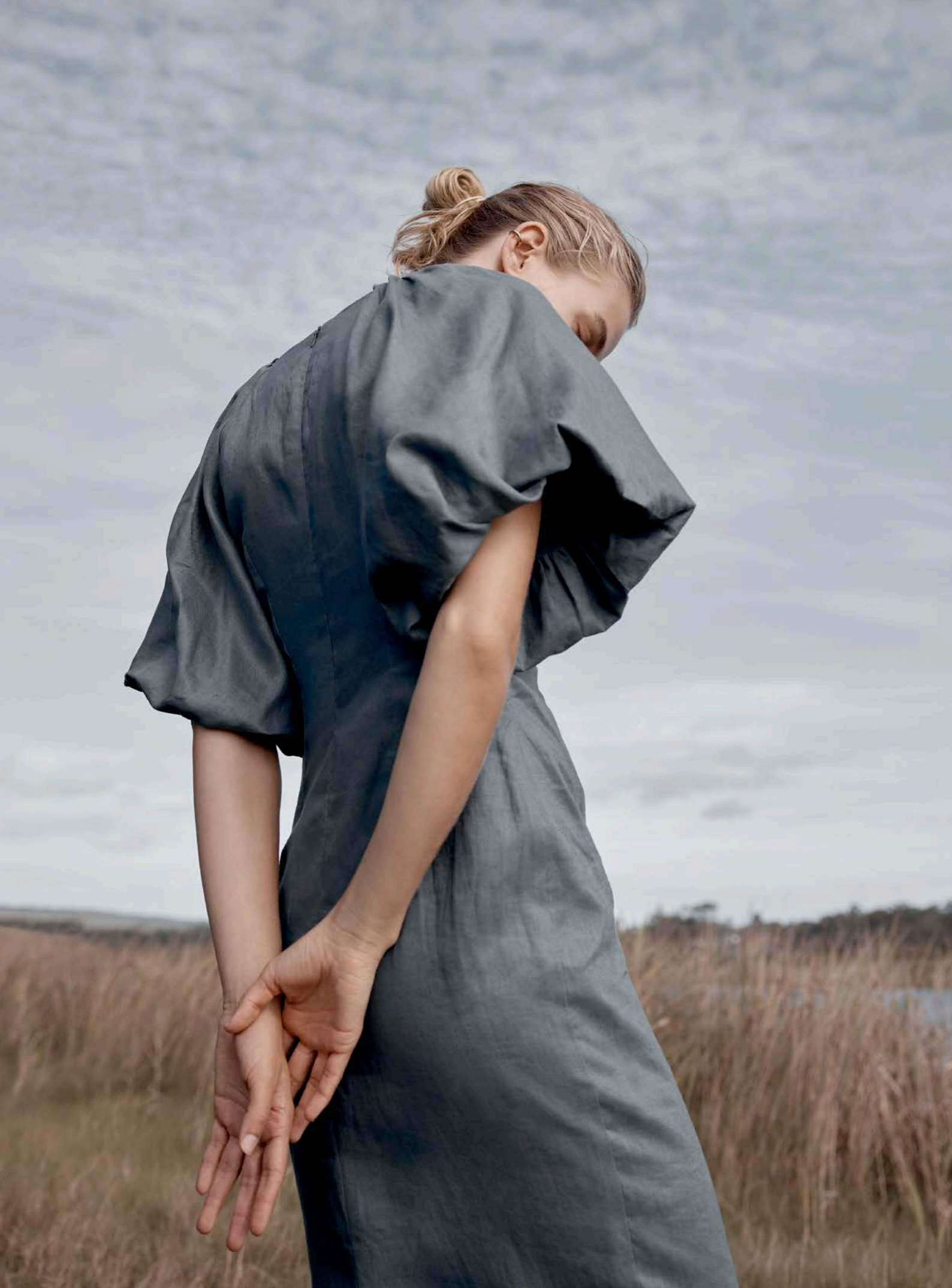
SEPTEMBER 21 | Mercy Linen Midi Dress in Ocean Blue