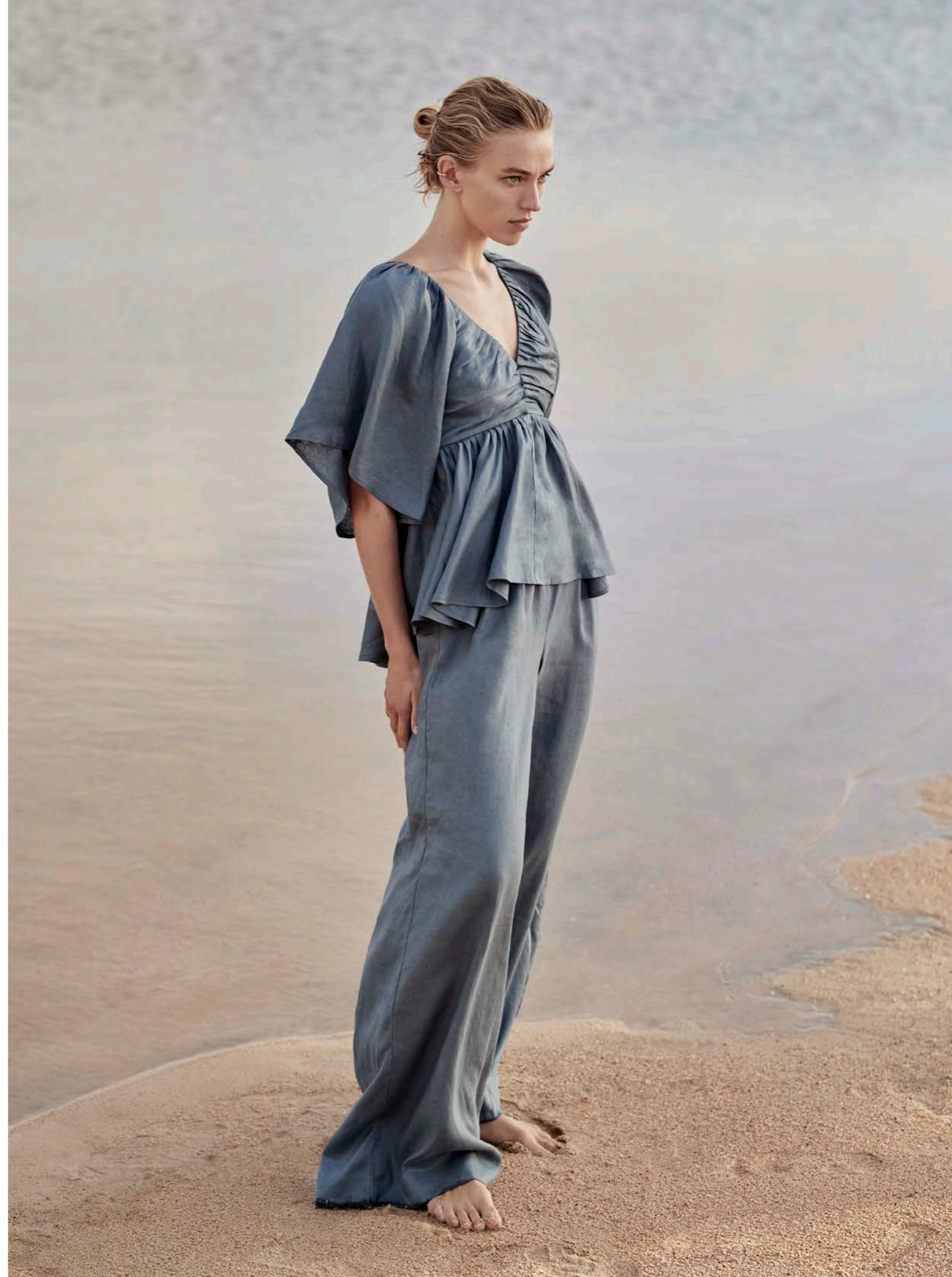
SEPTEMBER 21 | Sakura Linen Top & Sophia Linen Palazzo Pant in Ocean Blue