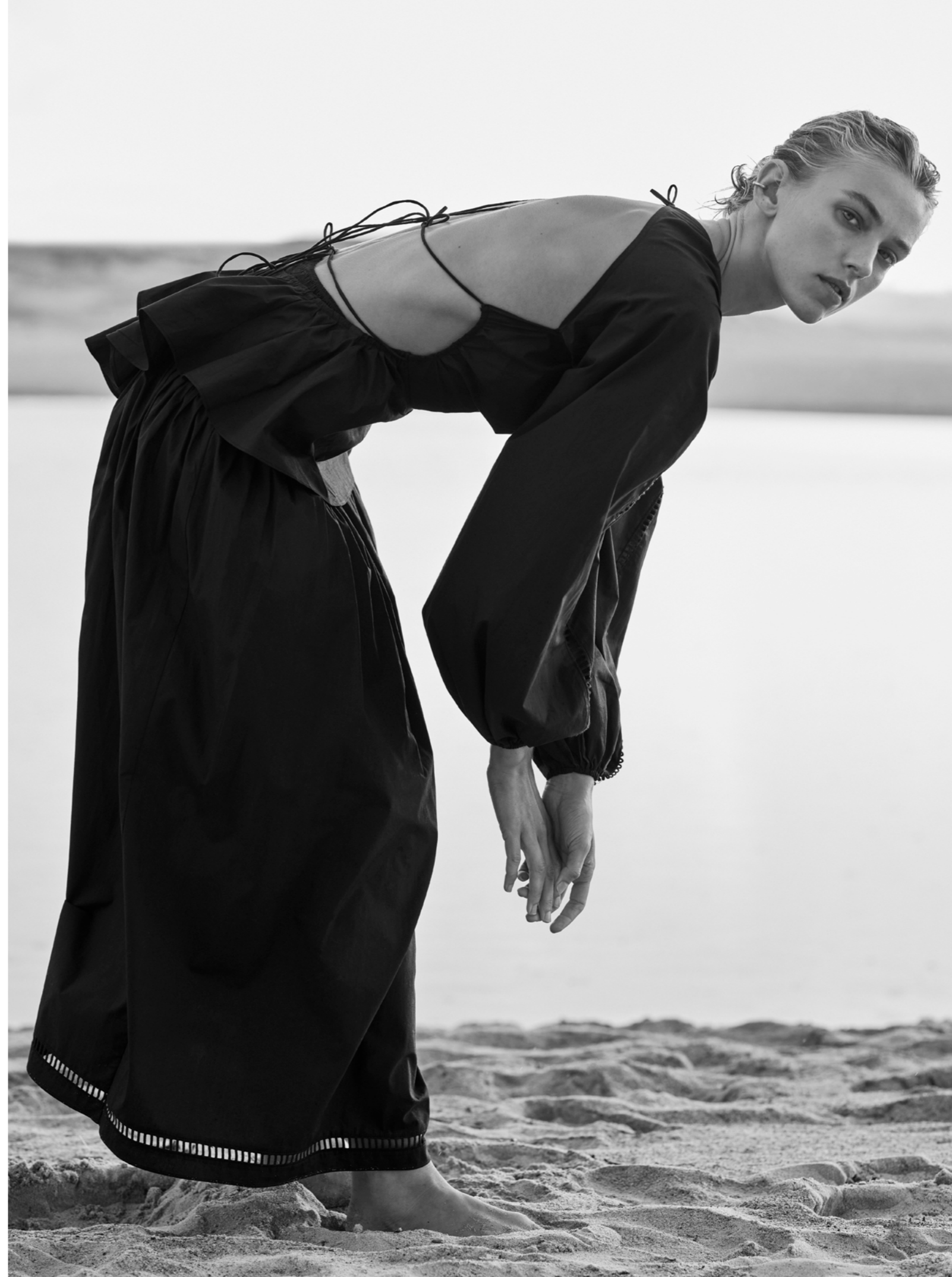
AUGUST 21 | Francis Organic Cotton Top & Yoko Organic Cotton Skirt/Dress in Navy