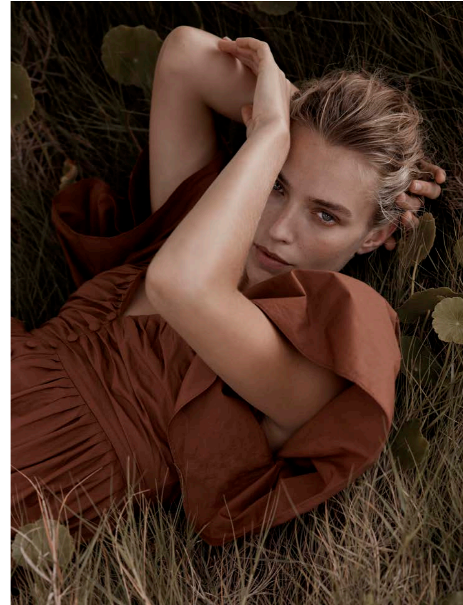
MAY 21 | Sakura Organic Cotton Midi Dress in Earth