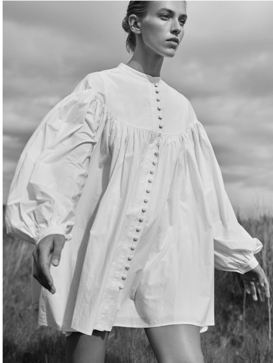
SEPTEMBER 21 | Caitlyn Organic Cotton Smock Shirt Dress in Optical White