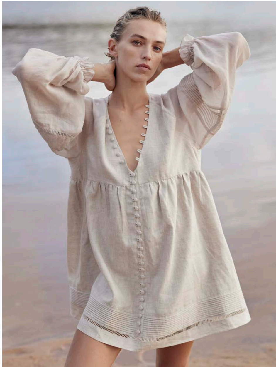
AUGUST 21 | Melinda Linen Ramie Mini Smock Dress in Flax