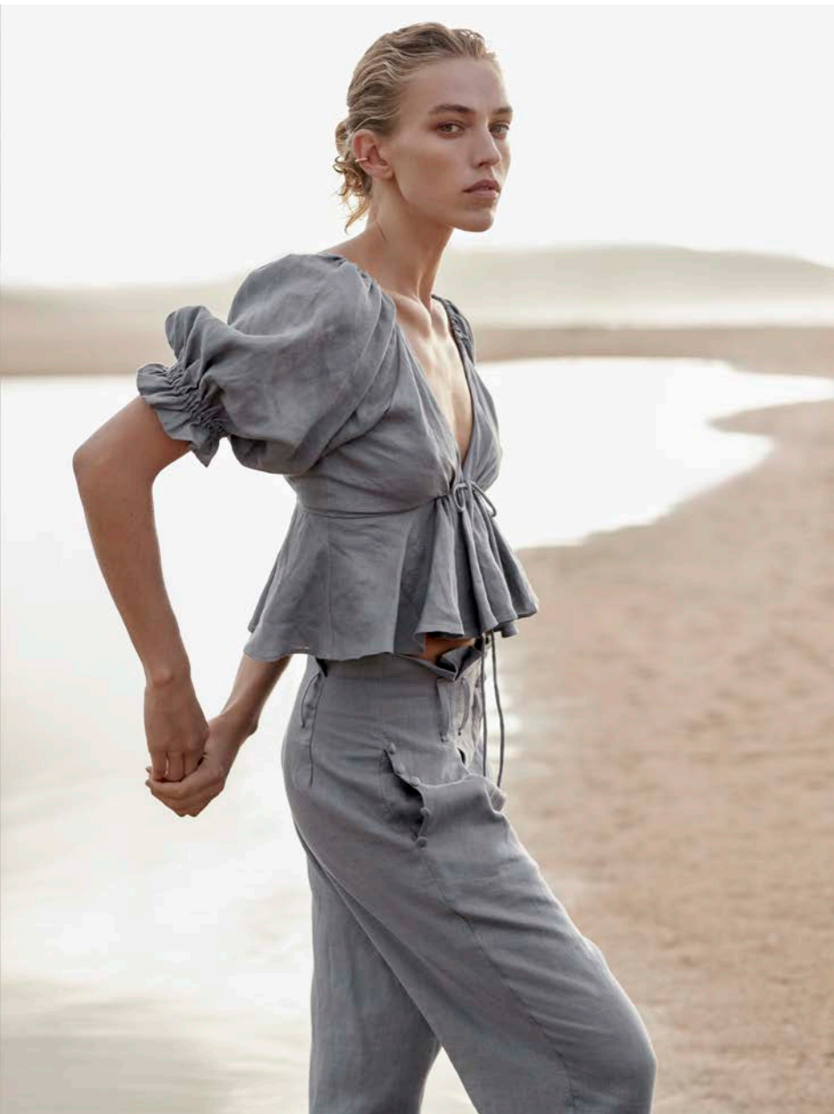
AUGUST 21 | Sophia Linen Top & Florence Linen Crop Pant in Slate Blue