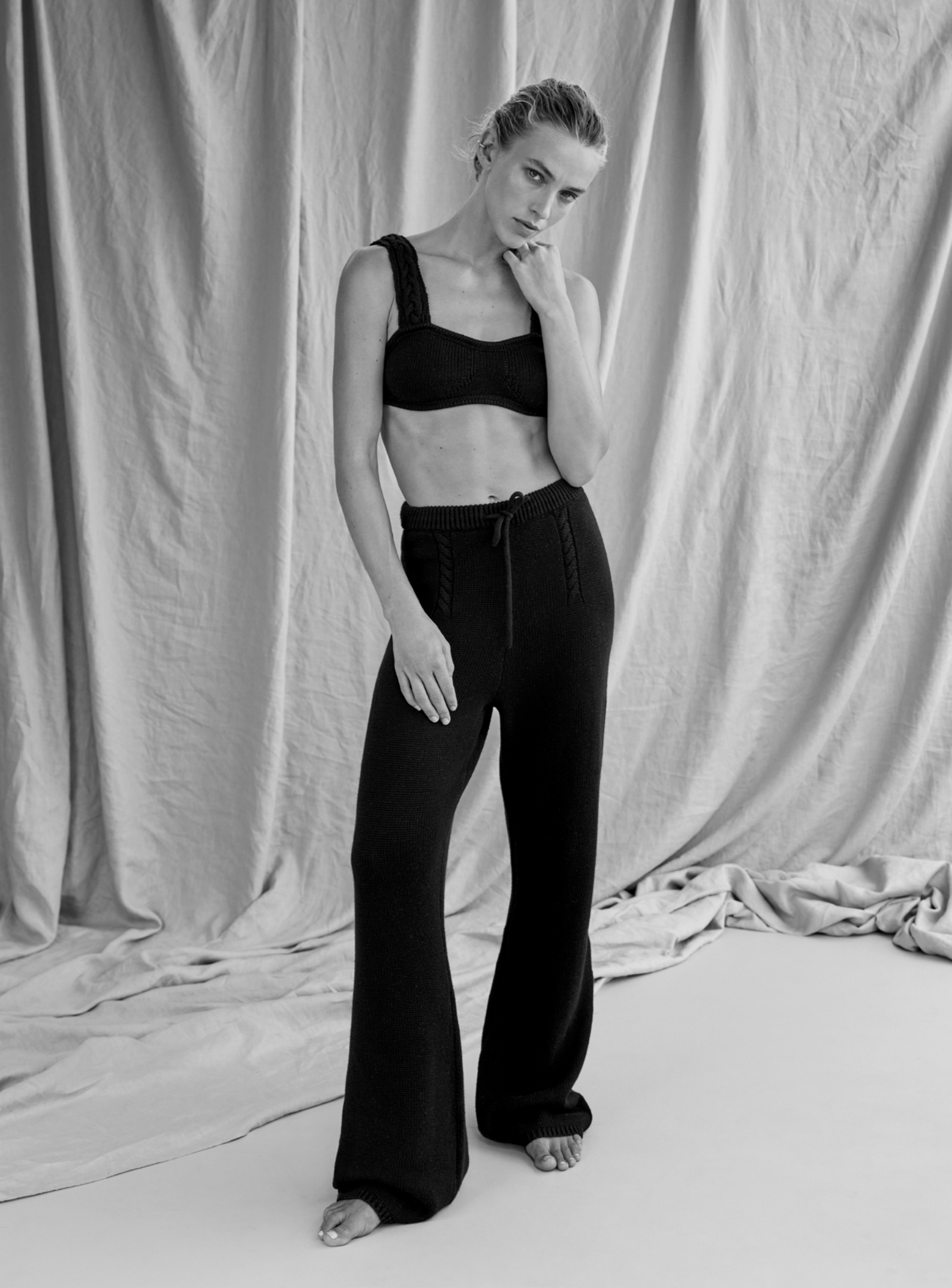
SEPTEMBER 21 | Brooklyn Cotton Cashmere Knit Bralette & Marlowe Cotton Cashmere Knit Pant in Black