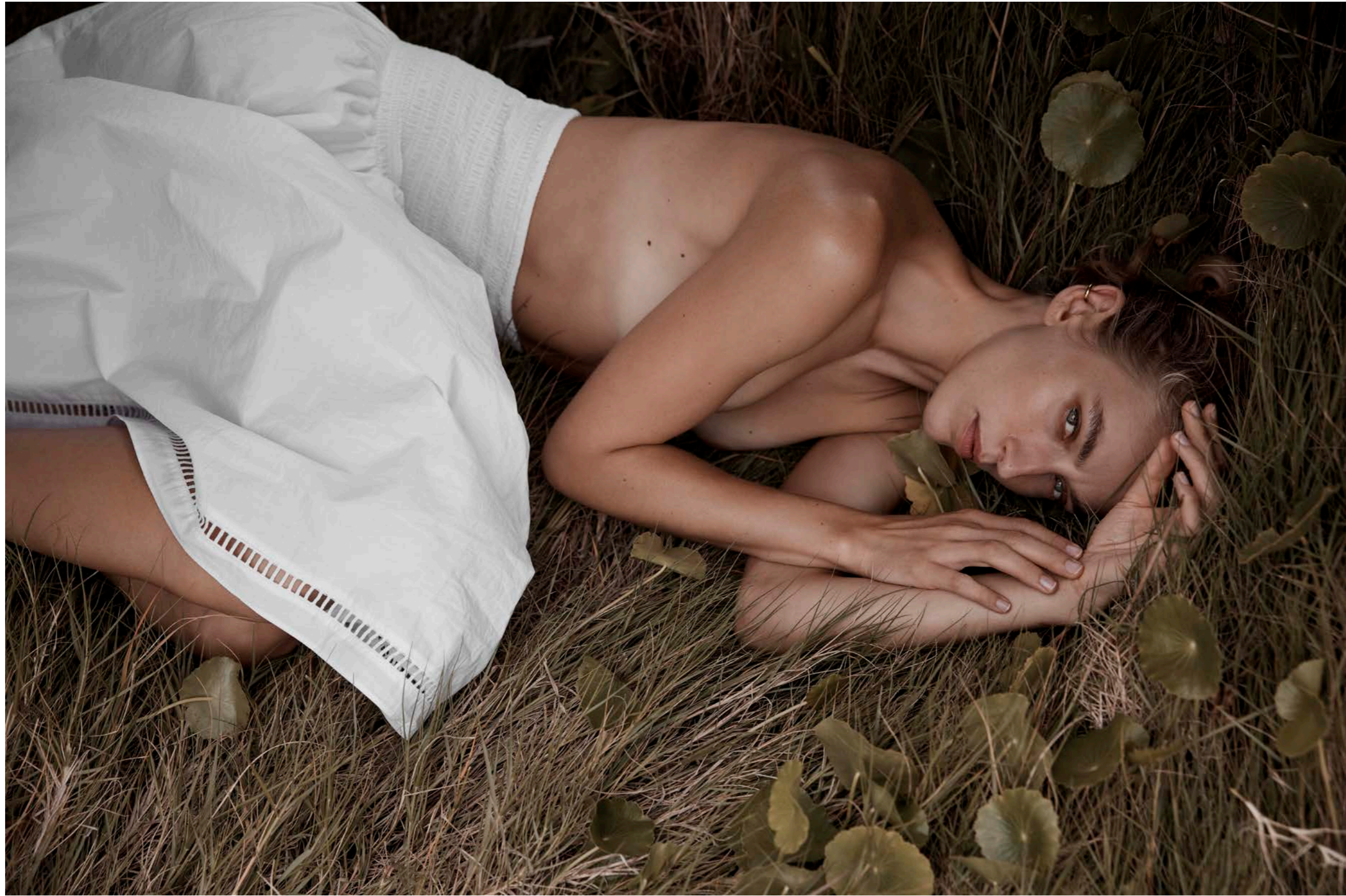
AUGUST 21 | Yoko Organic Cotton Skirt/Dress in Optical White