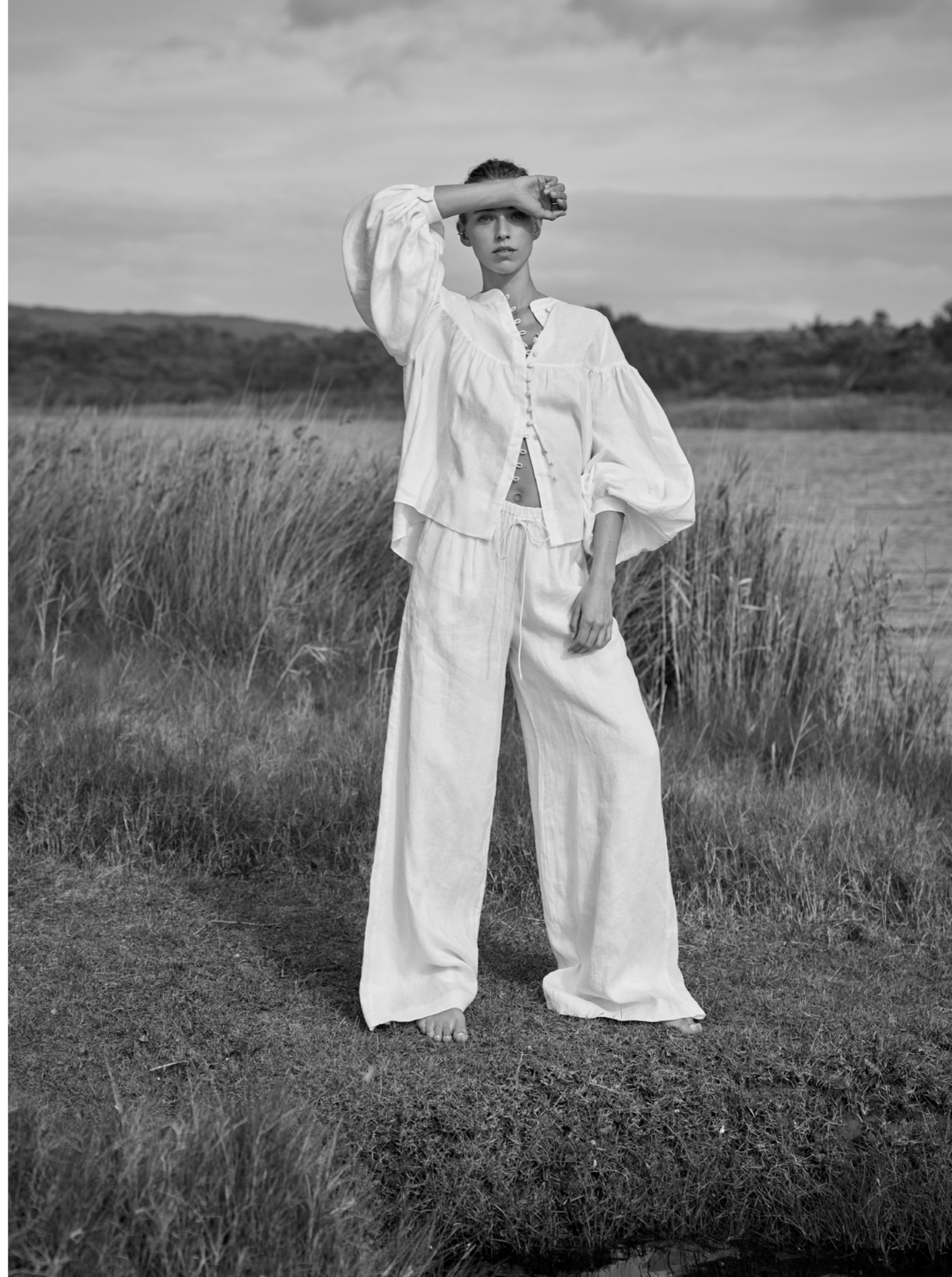
SEPTEMBER 21 | Caitlyn Linen Smock Shirt & Sophia Linen Palazzo Pant in Optical White