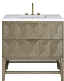
36" Vanity D100-V36-PBO 36" W x 23-1/2" D x 36" H