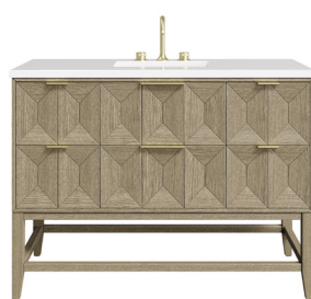
48" Vanity D100-V48-PBO 48" W x 23-1/2" D x 36" H