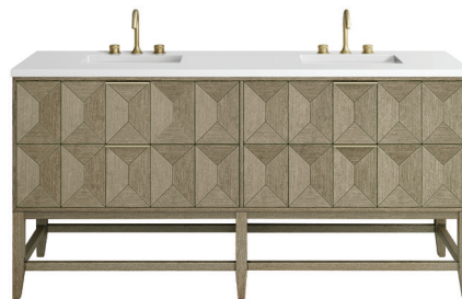
72" Double Vanity D100-V72-PBO 72" W x 23-1/2" D x 36" H

Measurements include countertops - sold separately