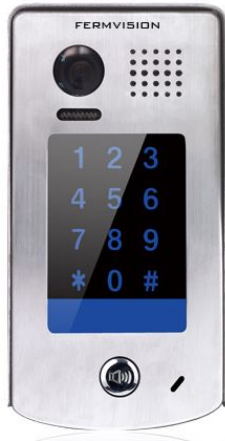
With keypad access Surface mount