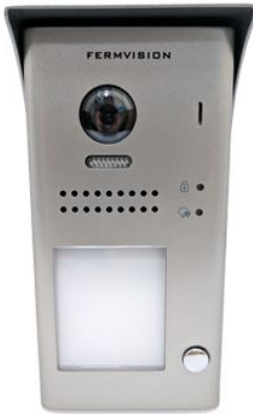
Video Intercom only Surface mount