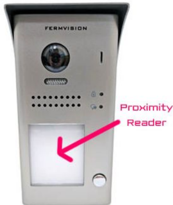
With proximity reader Surface mount