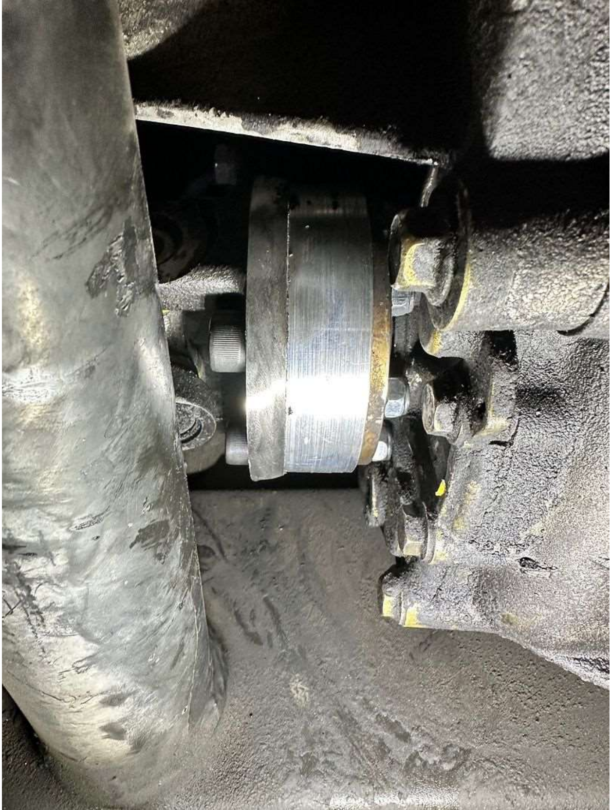
Now install front spacer to front axle on vehicle. Torque allen bolts to 35ft lbs.