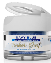
Navy Blue EJD134

Ingredients: Mica-Based Pearlescent, Dextrose, Blue 1, 2 Lake