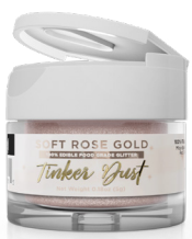
Soft Rose Gold EJD125

Ingredients: Mica-Based Pearlescent, Dextrose, Red 3, Red 40 Lake, Yellow 5, 6 Lake, Blue 2 Lake