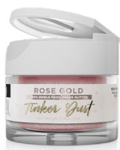
Rose Gold EJD123

Ingredients: Mica-Based Pearlescent, Iron Oxide