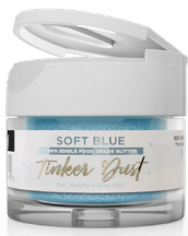
Soft Blue EJD105

Ingredients: Mica-Based Pearlescent, Dextrose, Blue 1, 2 Lake, Yellow 5 Lake