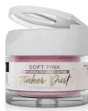
Soft Pink EJD110

Ingredients: Mica-Based Pearlescent, Red 3