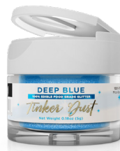
Deep Blue EJD124

Ingredients: Mica-Based Pearlescent, Dextrose, Blue 1, 2 Lake