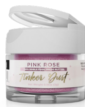
Pink Rose EJD103

Ingredients: Mica-Based Pearlescent, Red 3