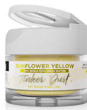
Sunflower Yellow EJD117

Ingredients: Mica-Based Pearlescent, Iron Oxide