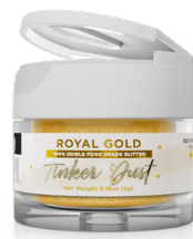
Royal Gold EJD153

Ingredients: Mica-Based Pearlescent, Dextrose, Yellow 5, 6 Lake