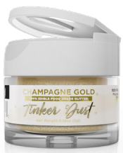
Champagne Gold EJD104

Ingredients: Mica-Based Pearlescent, Iron Oxide