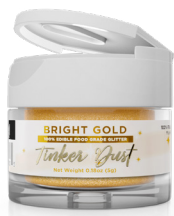
Bright Gold EJD130

Ingredients: Mica-Based Pearlescent, Iron Oxide