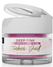
Deep Pink EJD109

Ingredients: Mica-Based Pearlescent, Dextrose, Red 3, Red 40 Lake, Yellow 5, 6 Lake, Blue 2 Lake