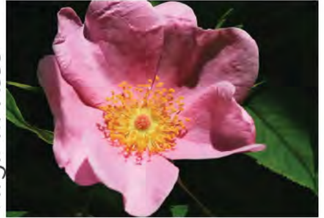
Rosa virginiana (S)