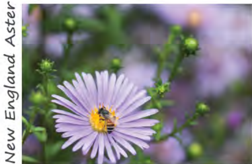
New England Aster