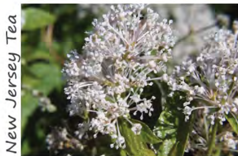
New Jersey Tea