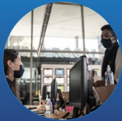
Wearing Face Masks