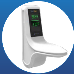
Entrance Temperature Scanning