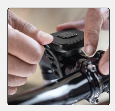
1. Wrap the Silicone Strap around the bar, pull snug, and connect to Main Hook.