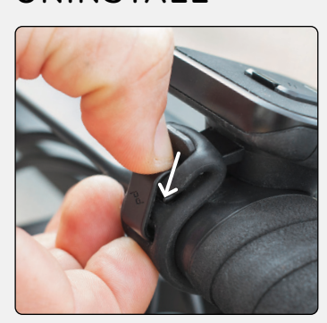
1. Push down on Keeper Hook.