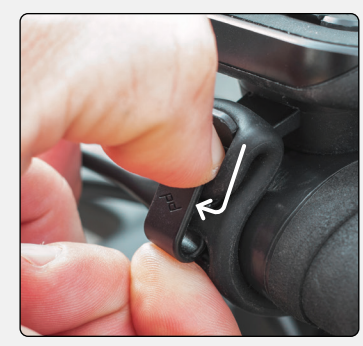
2. Lift Keeper Hook away from Silicone Band.