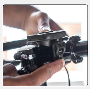
2. Secure excess Silicone Band by connecting Keeper Hook.