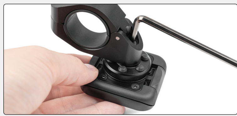
2. Reinstall the SlimLink™ Mount Head directly to the Handlebar Clamp.