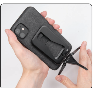
2. Pull legs down into tripod or kickstand mode. Mobile Tripod supports your phone in portrait and landscape orientations.