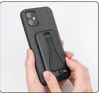
1. Mobile Tripod magnetically connects to the back of your phone. Requires Peak Design Case or MagSafe Phone/Case.