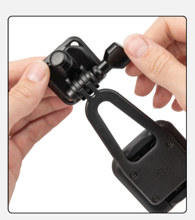
1. Connect Creator Kit Arm to provided Arca Adapter, tighten with Thumbscrew.