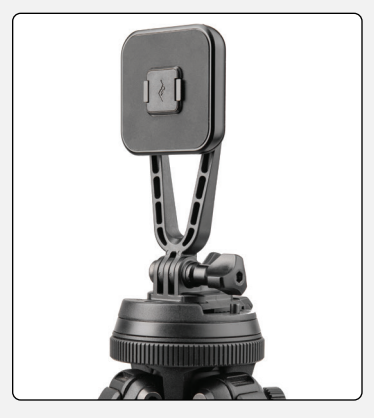
Peak Design Tripods.