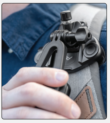
2. Slide Arca Adapter into Capture. Attach phone to SlimLink™ Mount Head in landscape mode. If needed, tighten Stabilizer Screw to eliminate play.