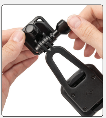
1. Connect Creator Kit Arm to 2. Attach plate to any Arca provided Arca Adapter, affix compatible tripod, including with provided Thumbscrew.