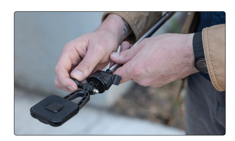
Rotate Use the provided Thumbscrew to adjust Creator Kit Arm angle.

Place phone on mount and listen for audible "click" to ensure your phone is locked. To remove, push just one of the Release Buttons and pull phone.