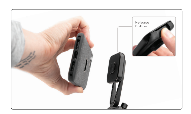
Attach/Detach Phone Requires Peak Design Case (sold separately).

Place phone on mount and listen for audible "click" to ensure your phone is locked. To remove, push just one of the Release Buttons and pull phone.