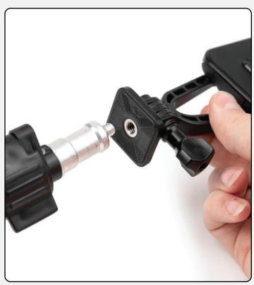
2. Connect Creator Kit to 1/4"-20 screw.