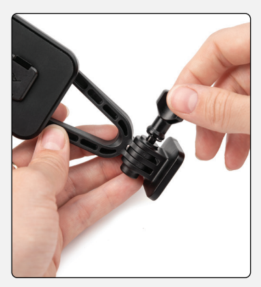
1. Install Creator Kit Arm to provided 1/4"-20 Adapter.