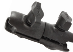
P/N: RAP-B-200-12U DOUBLE SOCKET SWIVEL ARM OVERALL LENGTH 4 1/4"