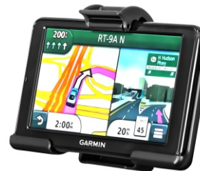
MODEL SPECIFIC GPS CRADLES (PART NUMBERS VARY)