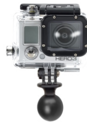
P/N: RAP-B-202U-GOP1 RAM® BALL ADAPTER FOR GOPRO® HERO SERIES