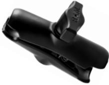
P/N: RAM-B-201U STANDARD DOUBLE SOCKET ARM OVERALL LENGTH 3 11/16"