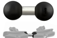
P/N: RAM-B-230U 1" DOUBLE BALL ADAPTER CONNECTS ANY TWO DOUBLE SOCKET ARMS

HUNDREDS OF OTHER COMPONENTS FOR YOUR MOTORCYCLE CAN BE FOUND AT WWW.RAMMOUNT.COM SUGGESTED SEARCH TERM: "B Components"