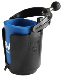
P/N: RAM-B-132BU RAM® SELF-LEVELING DRINK CUP HOLDER