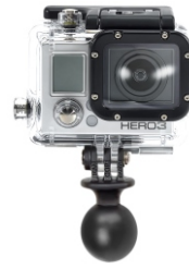
P/N: RAP-B-202U-GOP1 RAM® BALL ADAPTER FOR GOPRO® HERO SERIES