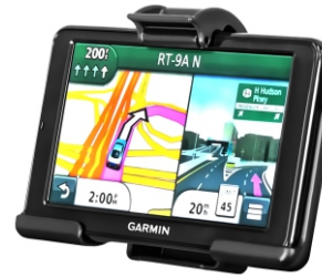
MODEL SPECIFIC GPS CRADLES (PART NUMBERS VARY)