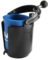
P/N: RAM-B-132BU RAM® SELF-LEVELING DRINK CUP HOLDER