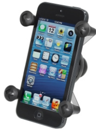
P/N: RAM-HOL-UN7BU RAM® X-Grip® UNIVERSAL PHONE HOLDER