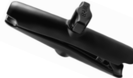
P/N: RAM-B-201U-C LONG DOUBLE SOCKET ARM OVERALL LENGTH 6"