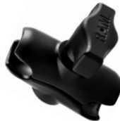
P/N: RAM-B-201U-A SHORT DOUBLE SOCKET ARM OVERALL LENGTH 2 7/16"