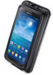
P/N: RAM-HOL-AQ7-2COU RAM AQUA BOX® PRO 20 WEATHERPROOF PHONE CASE