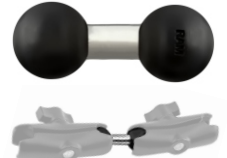
P/N: RAM-B-230U 1" DOUBLE BALL ADAPTER CONNECTS ANY TWO DOUBLE SOCKET ARMS

HUNDREDS OF OTHER COMPONENTS FOR YOUR MOTORCYCLE CAN BE FOUND AT WWW.RAMMOUNT.COM SUGGESTED SEARCH TERM: "B Components"