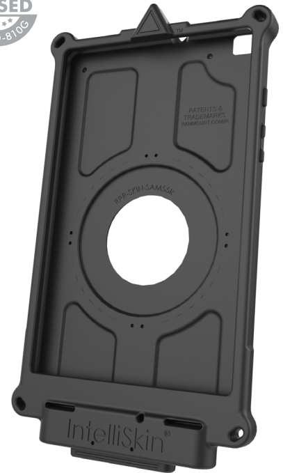
Patented and Pats. Pend