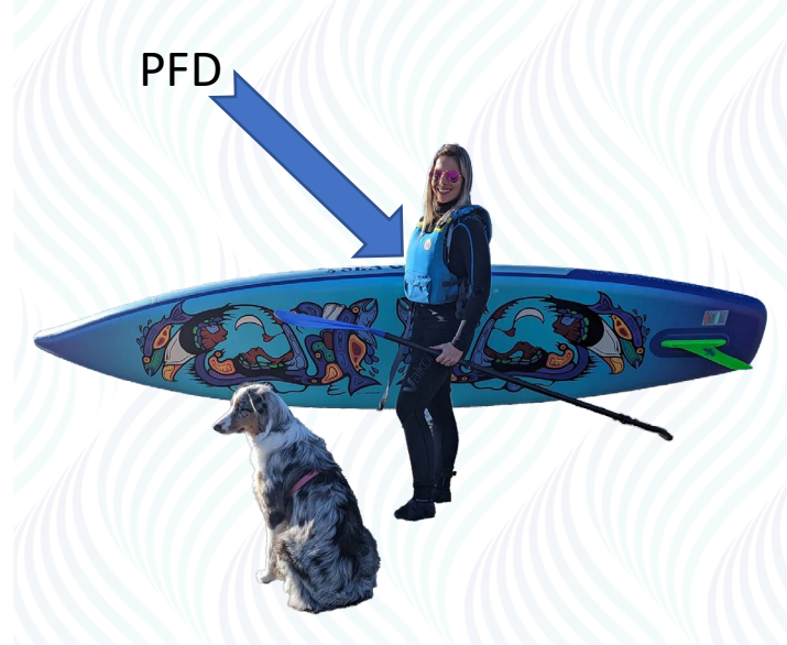
Board – Carta Marina Shown

Transport Canada requires that when paddling in Canadian waters you possess a Canadian Coast Guard approved Personal Floatation Device (PFD) with an attached pea-less whistle. While the front cargo area is a handy place to store your PFD for immediate use, Sea Gods wants you to be safe and recommends you always wear your PFD. Familiarize yourself with the local laws and water right of ways before heading out. Always obey the law. Check the weather and wind/ currents and only use your board in conditions that support your skill level. Always wear your Safety Leash and PFD and SUP with a buddy. Let somebody know where you plan to go and when you expect to be back. Use common sense and be prepared for conditions. Be safe and have fun!