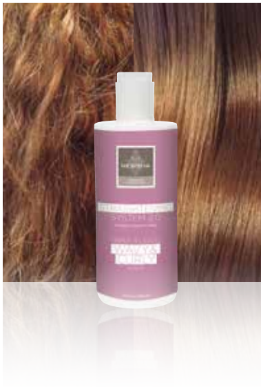
TRIPLE.S LIQUID WAVY & CURLY HAIR