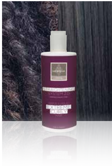
TRIPLE.S LIQUID EXTREME CURLY HAIR