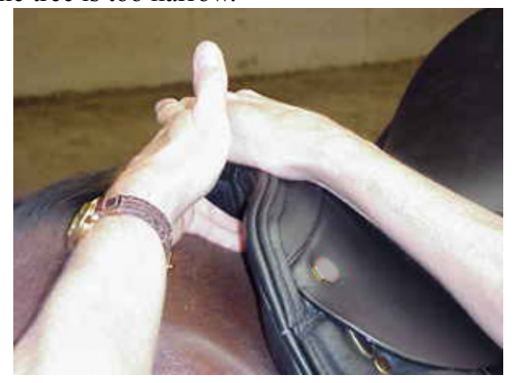
Saddle is too wide