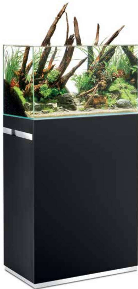
ScaperLine 60 Set black