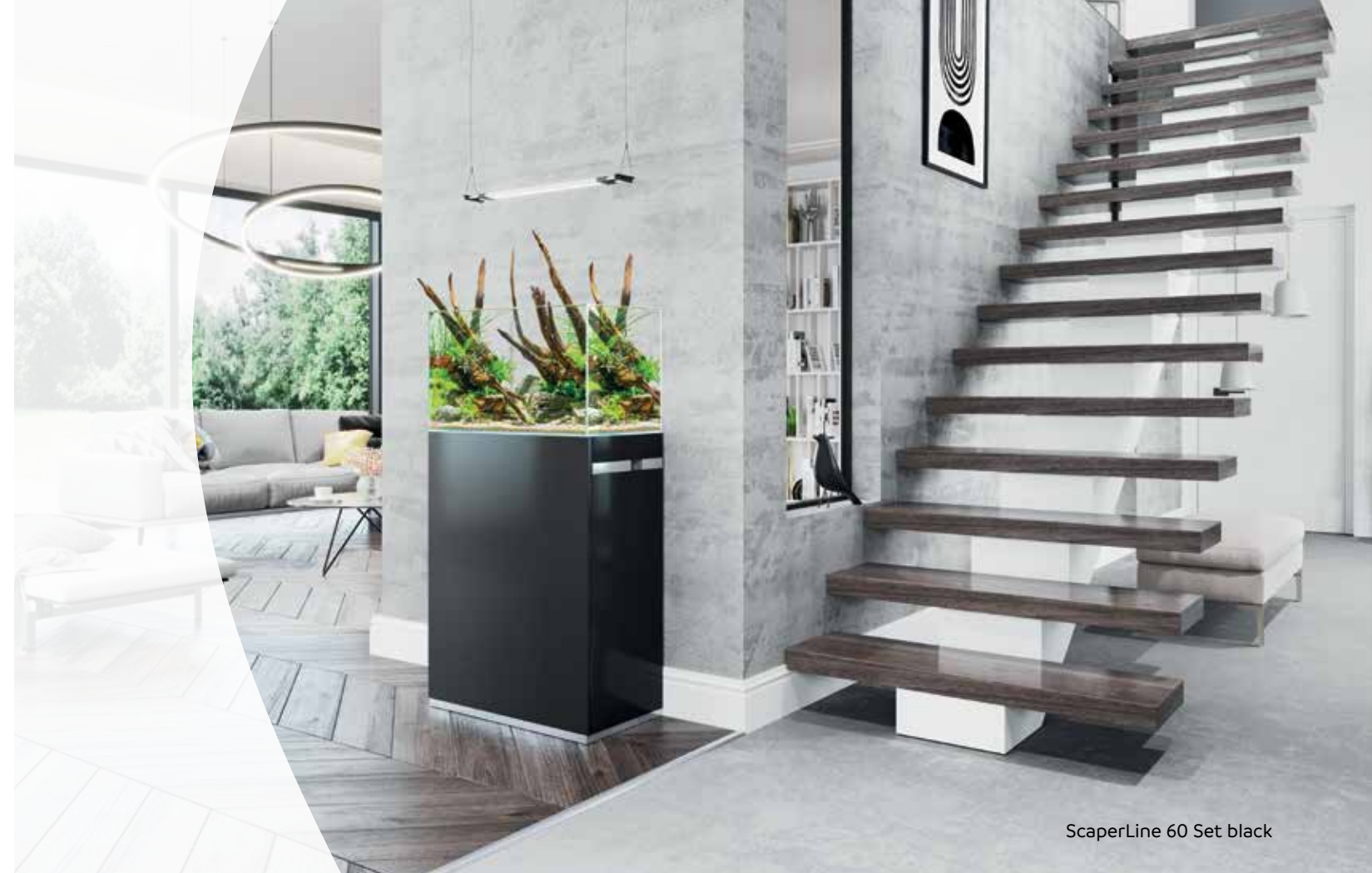
ScaperLine 60 Set black