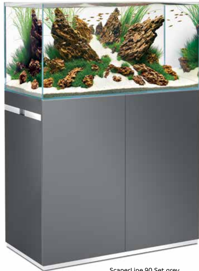
ScaperLine 90 Set grey