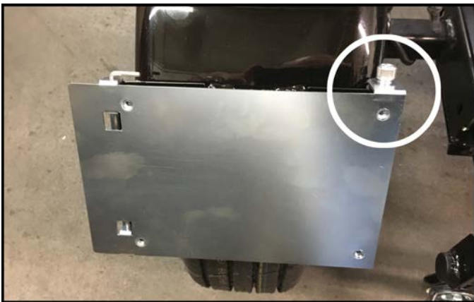
Photo: Tighten the thumbscrew on the closed SOLPH