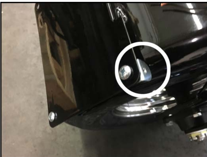
Photo: Small bracket installed properly