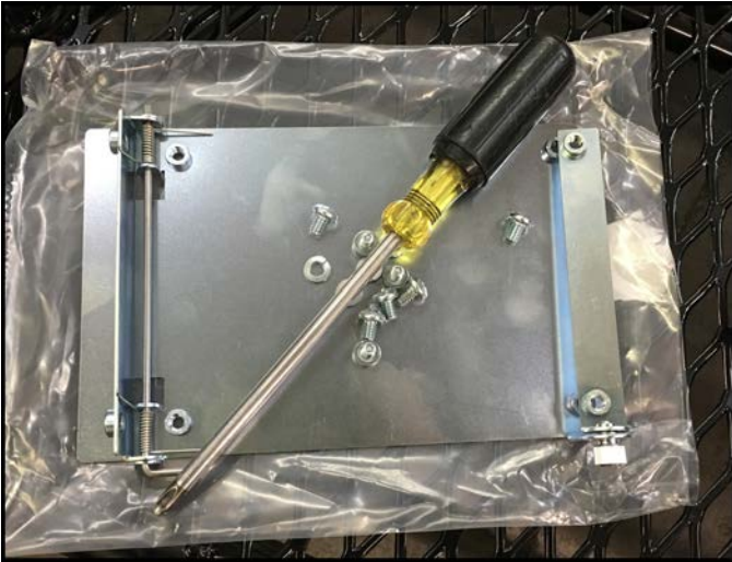
Photo: SOLPH with all parts & install tools