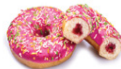
STRAWBERRY DONUT WITH STRAWBERRY FILLING CTN PACKING: 36 67 G