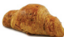
Croissant Zaata SIZE: 25 G PACKING:160