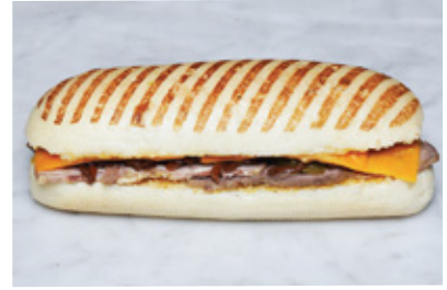
Panini Roast Beef