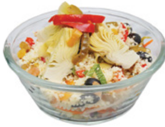
Moroccan Couscous Salad