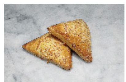
Fatayer Turkey and Cheese