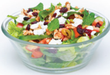
Cranberry Feta Salad