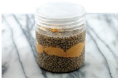
Peanut Butter Chia Pudding