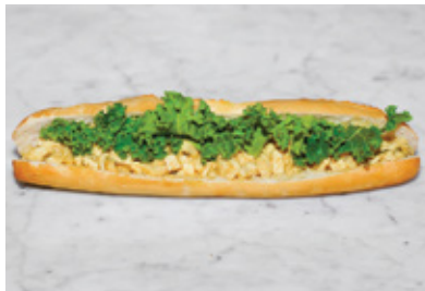
Coronation Chicken Sandwich