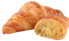
Croissant plain Butter Regular 22% SIZE: 70 G PACKING: 50