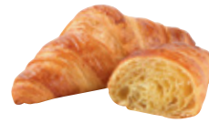
Croissant Butter Medium 24% SIZE:55 G PACKING:80