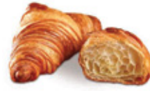
Croissant Mini SIZE: 30 G PACKING:180