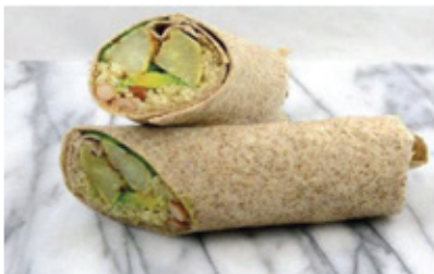
Ultimate Vegan Burrito