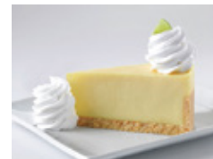
Retail Original Plain Cheesecake 964 G 7" 8 INCH