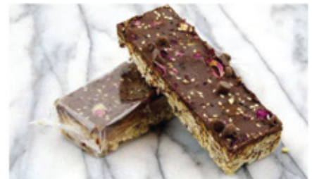
Chocolate Tahina Oats Bar