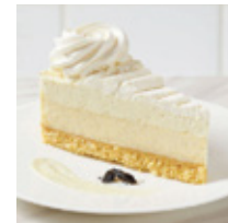
Triple Vanilla Cheesecake Seasonal 2.2 KG 10 INCH