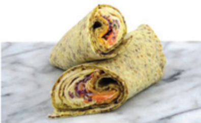
Asian Sesame Chicken in Protein Bread