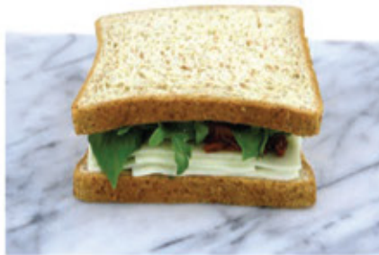
Mozarella Pesto & Sundried Tomatoes