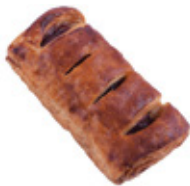
Mini Duo Apple & Maple Syrup SIZE:35 G PACKING:120