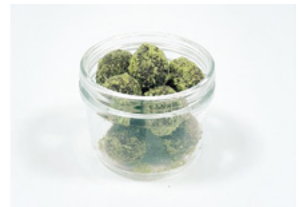
Pecan Pie Energy Ball