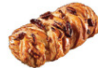
Plait Pecan Maple SIZE:95 G PACKING:48