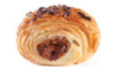
Chocolate - Hazelnut Roll Mini SIZE: 25 G PACKING:200