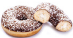
COCO DONUT WITH COCONUT FILLING CTN PACKING: 36 70 G