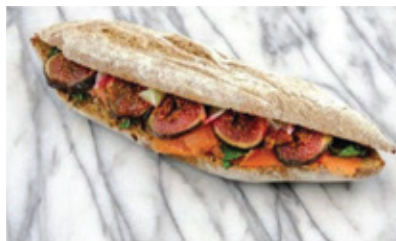
Smoked Salmon Fig Sandwich