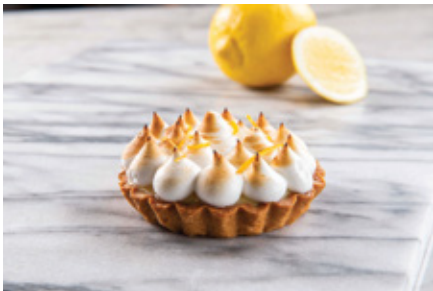
Lemon Meringue tart