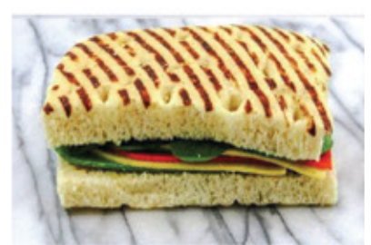
Focaccia Triple Cheese Sandwich