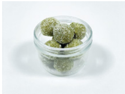
Superfood Matcha Energy Ball