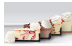
Grand Selection Cheesecake 992 G 7" 8 INCH