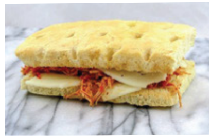
Slow Cooked Italian Sandwich