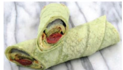
Tuscan Veggie Wrap