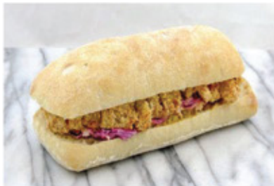
Breaded Chicken Sandwich