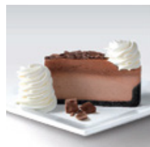
Retail Pack Chocolate Mousse Cheesecake 1 KG 7" 8 INCH