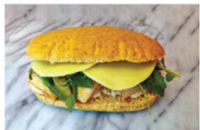
Aioli Avocado Chicken Sandwich