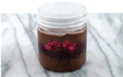
Almond Chocolate Chia Seeds