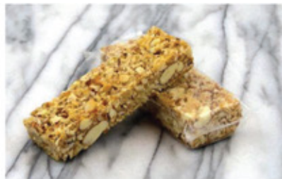
Easy Protein Bar