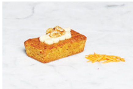
Milk Rose cake