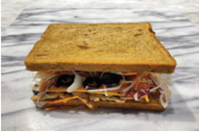
Arabiatta Chicken Sandwich