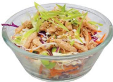
Teriyaki Chicken Bowl