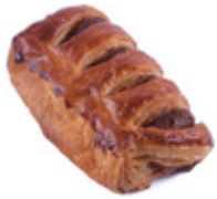
Mini Duo Chocolate Hazelnut SIZE:35 G PACKING:120