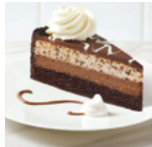
Tuxedo Cheesecake 2.2 KG 10 INCH