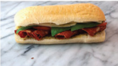
Pesto Provolone Sandwich