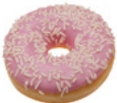
DOUBLE CHOC DONUT WITH COCOA TOPPING CTN PACKING: 36 53 G