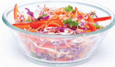
Thai Veggies Salad