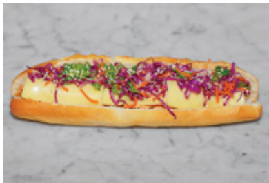
Asian BBQ Chicken Sandwich