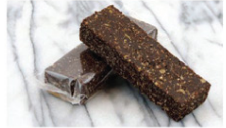
Chocolate chia seeds Bar