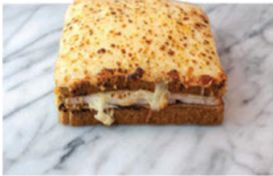
Croque Madame Sandwich