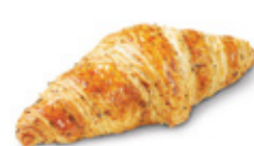
Croissant Btr Min Fr Zaatar Classic-T79565 SIZE: 25 G PACKING: 240