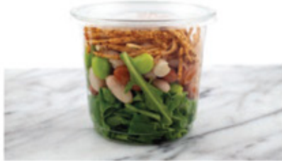
Triple Beans Mix