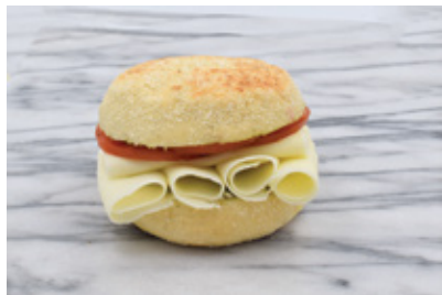
English Muffin with Cheese & Pesto