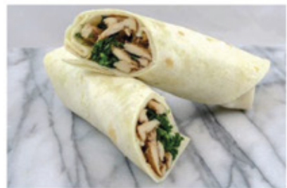
Chicken Kale Shawarma Wrap