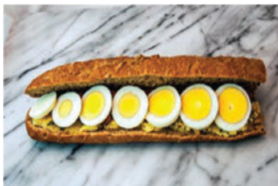
GH Potato Special