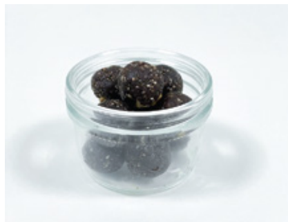
Nut latte Ball