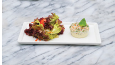
Eggs Tomato Basil