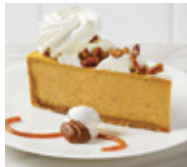
Pumpkin Cheesecake Seasonal 2.2 KG 10 INCH