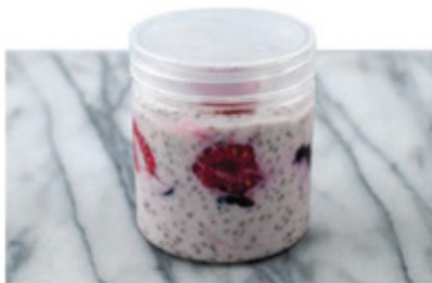
Mixed Berries Chia Parfait