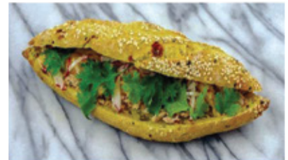
Mango Tuna Sandwich