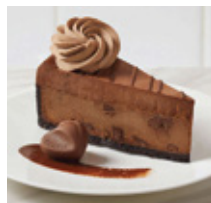
Godiva Double Cheesecake Seasonal 2.2 KG 10 INCH