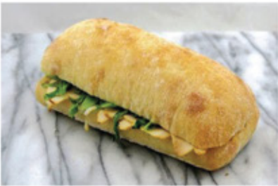
Cajun Chicken Sandwich