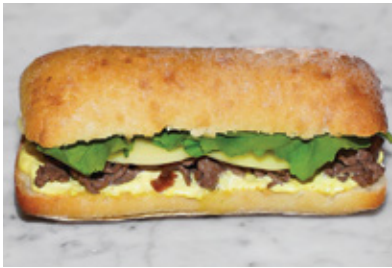
Horseradish Roast Beef Sandwich