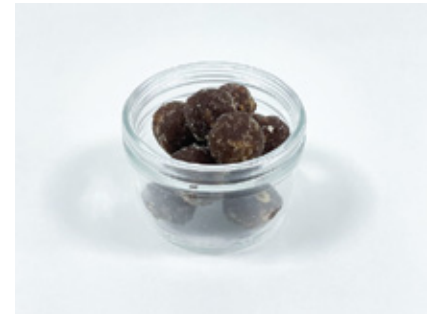
Cinnamon Apple Energy Ball