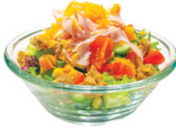
Smoked Turkey Roll Salad