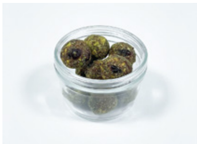
Cranberry Pistachio Ball