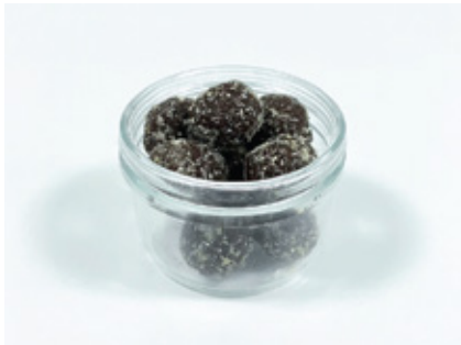
Dark Choco Chia Ball