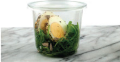
Purple Egg Spinach Pot