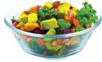
Roasted Pumpkin & Beetroot Salad