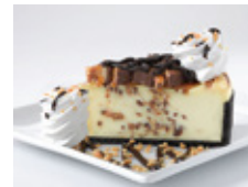
Candy Bar Cheesecake Seasonal 2.2 KG 10 INCH