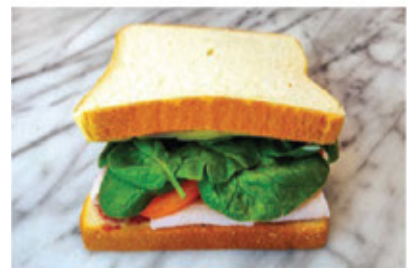
Turkey on Cherry & Raspberry Spread