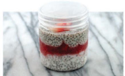
Strawberry Chia Parfait