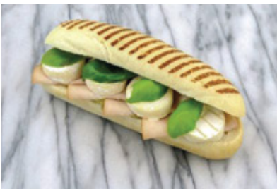
Turkey Brie Panini