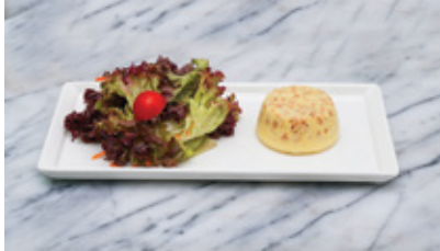
Eggs Turkey Ham and Cheese