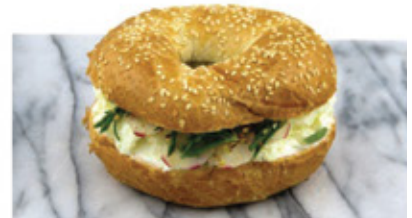
Egg white Labne