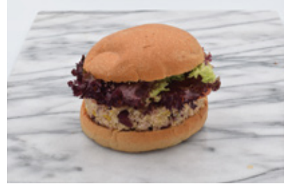
Vegan Quinoa Burger