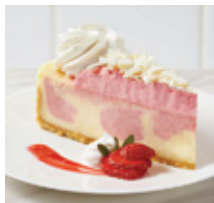
Strawberry Cream Cheesecake Seasonal 2.2 KG 10 INCH