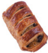
Mini Duo Chocolate Orange SIZE:35 G PACKING:120