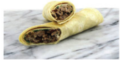
The Juicy Beef Shawarma