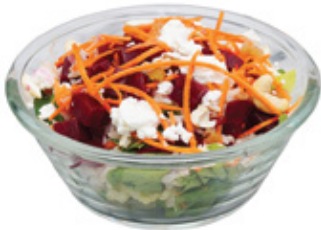
Beet Power Salad