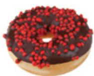
BLACK MINIDONUTS CTN PACKING: 100 29 G