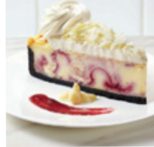
White Choco Raspberry Cheesecake 2.2 KG 10 INCH