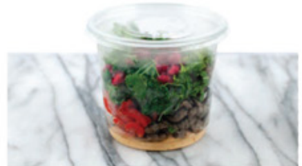
Beef Peppers Hummus