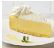
Key Lime Cheesecake Seasonal 2.2 KG 10 INCH