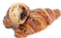
Chocolate Hazelnuts Filled Croissant SIZE: 90 G PACKING:48