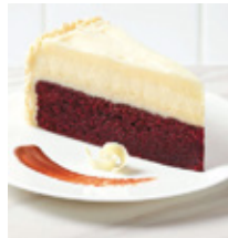
Crazy Red Velvet Cheesecake 2.2 KG 10 INCH