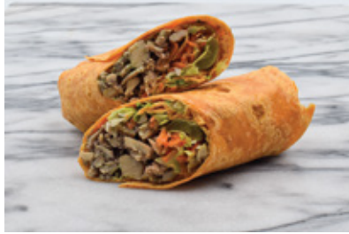
Yogurt Tahina Chicken Sandwich