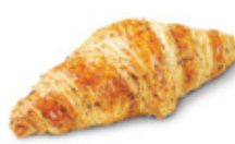
Croissant French Zaatar Butter SIZE:90 G PACKING:50