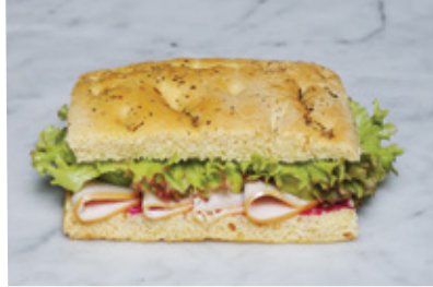
Turkey Ham & Turkey Smoked