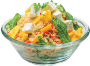
Quinoa Mango Salad