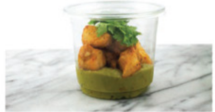
Avocado Chicken Pot