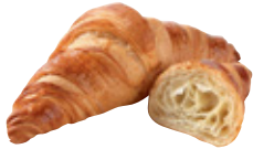
Croissant plain Butter Large 18% SIZE:90 G PACKING:80