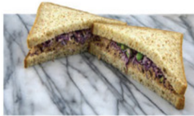
Untraditional Tuna Mayo