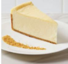
Original Plain Cheesecake 2.2 KG 10 INCH