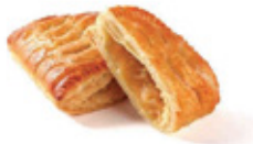
Apple Turnover Heritage 27945 SIZE:100 G PACKING:48