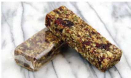
Dried Cherry & Almond Energy Bar