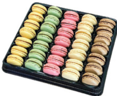
SWEET MACAROONS PACKING: 4x12g

www.greenhouseuae.com For your order please send email to cateringsales@greenhouseuae.com Or call us on 052 6472009