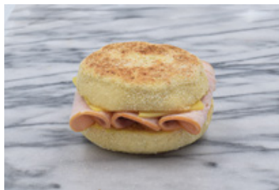
English Muffin with Turkey & Cheese