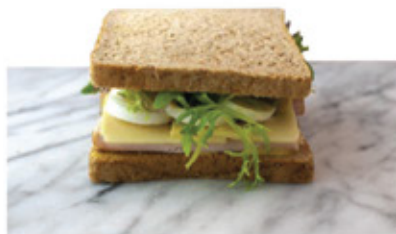
Green Club Sandwich