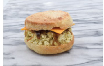
English Muffin with Scrambled eggs