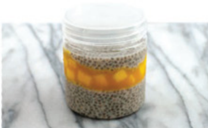
Exotic Soy Pudding