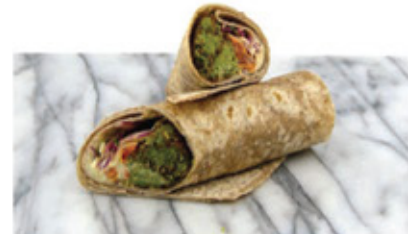
Baked Falafel in Brown Tortilla Bread