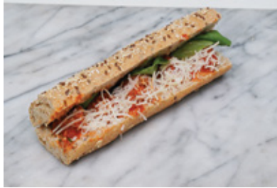
Plant Based Tomato Meatballs Sandwich