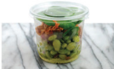
Edamame Pulled Chicken