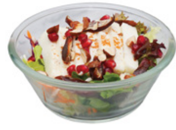
Grilled Halloumi Salad