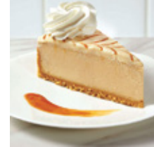
Dulce De Lece Cheesecake 2.2 KG 10 INCH