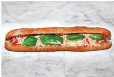
Tomato Meatballs Sandwich