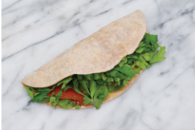
Vegan Kafta Sandwich