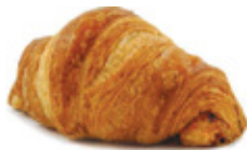
Croissant Heritage 27234 SIZE:70 G PACKING:60