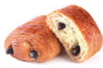
Chocolate Roll SIZE: 75 G PACKING: 60