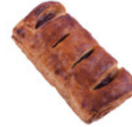
Mini Duo Cherry Griottes SIZE:35 G PACKING:120