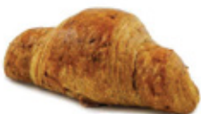
Croissant Zaatar SIZE: 30 G PACKING:200