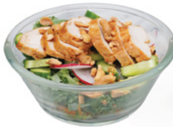
Chicken kale Salad