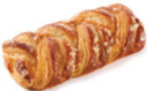
Plait Vanilla Custard SIZE: 95 G PACKING:48