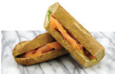
Passion Fruit & Mango Smoked Salmon