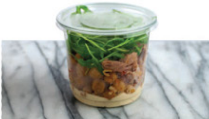
Tuna Chickpeas Pot