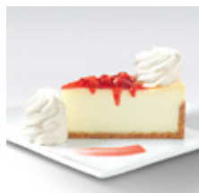
Retail Pack Strawberry Topped Cheesecake 1 KG 7" 8 INCH