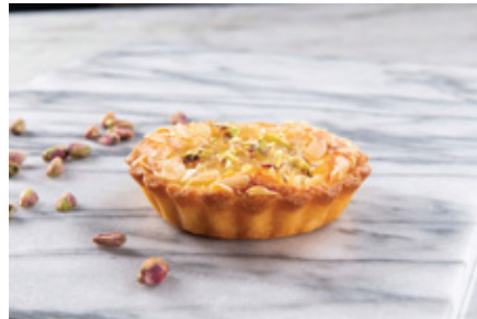
Almond & pears tart