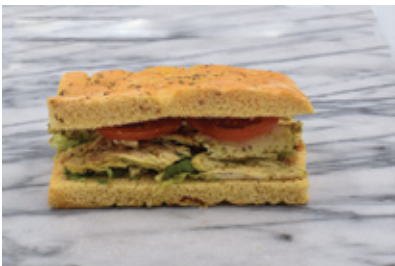
Oriental Zaatar Chicken Sandwich