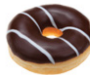
STRIPE MINIDONUTS CTN PACKING: 100 29 G