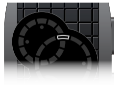
PM / Charging Indicator