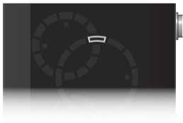
PM / Charging Indicator