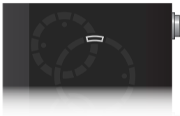
PM / Charging Indicator