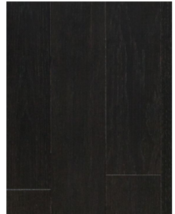
PORT HOPE, SXCO92215