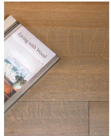
RADCLIFF, RFG606 Price: $15.39/SF