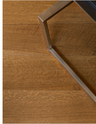
HOPKINSVILLE, RFG602 Price: $15.39/SF