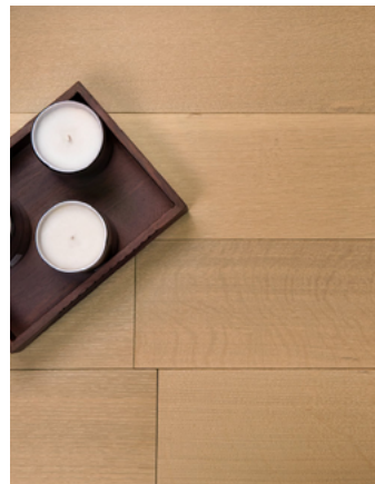
PADUCAH, RFG605 Price: $15.39/SF