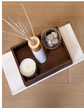
HENDERSON, RFG604 Price: $15.39/SF