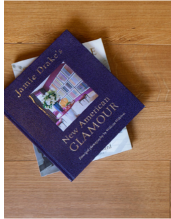
SHIVELY (NATURAL COLOR), RFG601 Price: $15.39/SF