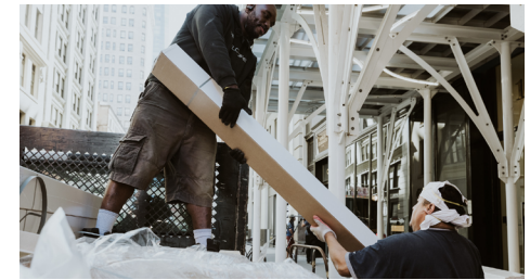
PHASE 4 Receiving and enjoying your creation