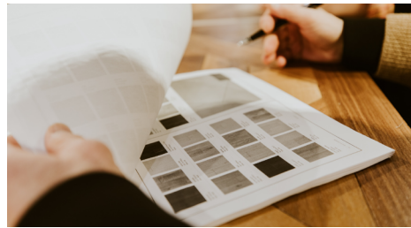
PHASE 2 Creating the plan