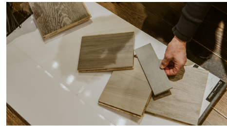
PHASE 3 Building the foundation