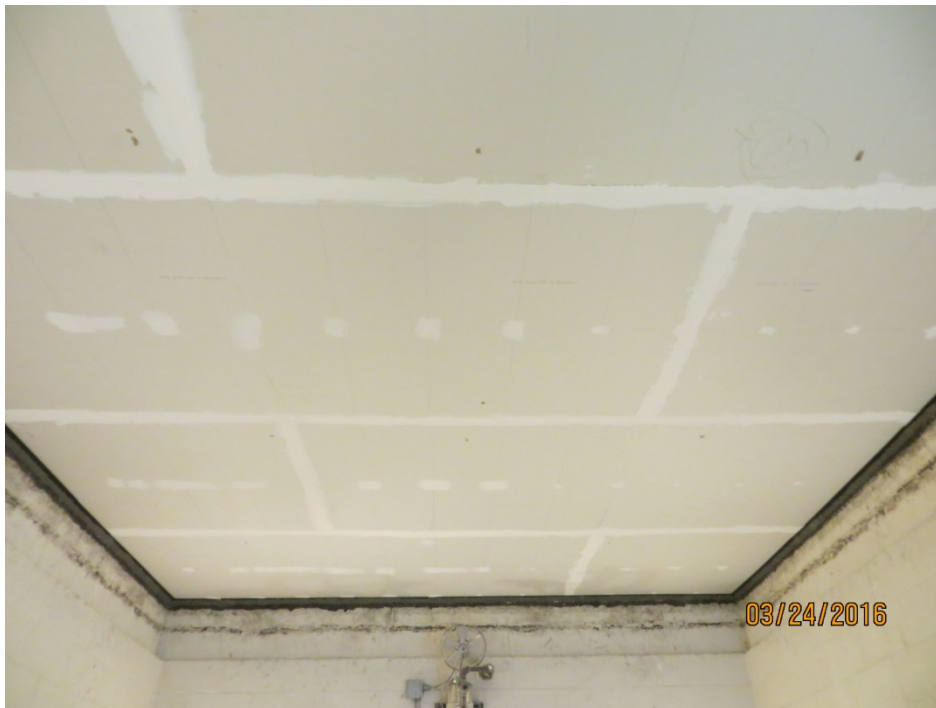
Figure 2 - Specimen mounted in the test opening (source side).