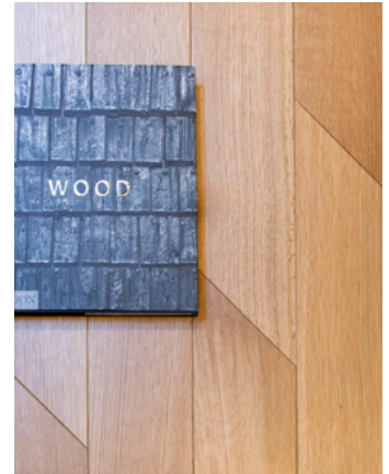
TALLAHASSEE (NATURAL COLOR), ASO800-RQA