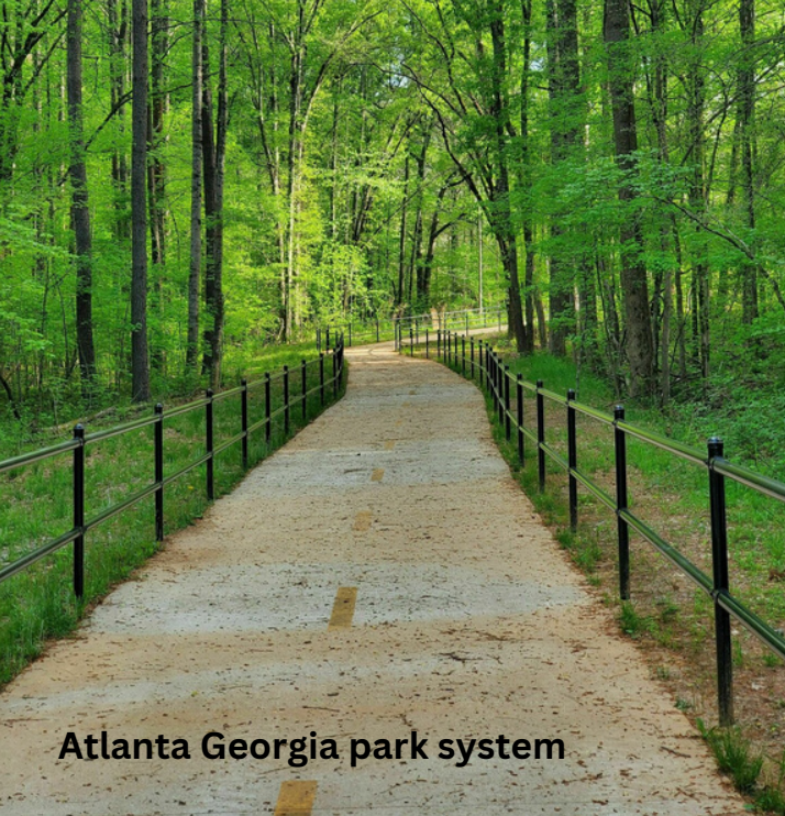
Atlanta Georgia park system