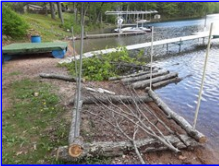
...starting the crib assembly

The Fisheries Committee has completed their first fish crib. This one will be used as a prototype for additional cribs that are going to be built. The divers have been asked to mark on a map where existing cribs are located. They have also been asked to recommend good spots to place cribs. The divers go out to 15 feet of water. Cribs will be placed beyond the 15 feet so as not to interfere with diver lines. By DNR regulations, cribs are not suppose to be placed within 100 feet of swimming beaches or swim rafts.