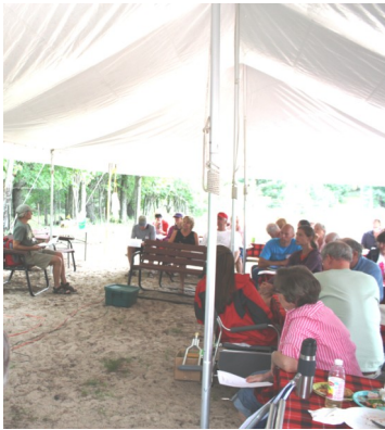
Annual Meeting under the tent on Roger's beach