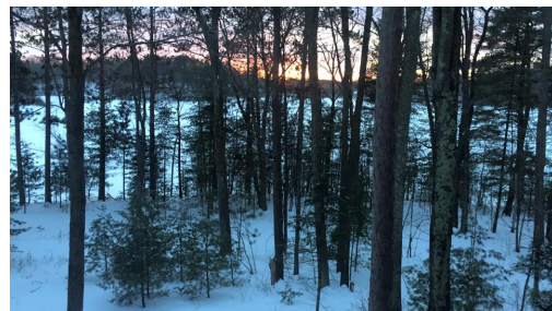
Winter sunset on Squash Lake