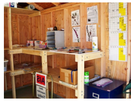
Arrival and finishing inside SLA shed