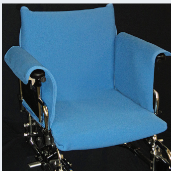
Complete Wheelchair Cover