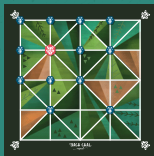
Fig.3 A trapped Tiger

If a Tiger has no legal moves available, it is considered trapped (see Fig 3). But if a legal move becomes available, it is no longer considered trapped.