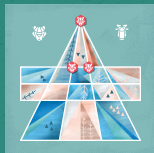
Fig.4 Tiger starting positions

Lay out the playmat with the Mountain (teal) side up. Use only 15 Goats