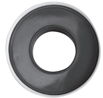
Teflon Pipe Thread Tape - 30" 1x