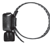
Worm Gear Clamp 4x