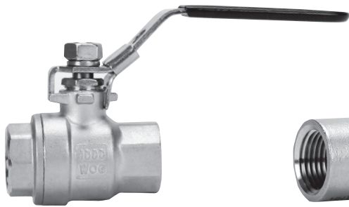
1/2" Stainless Ball Valve 1x