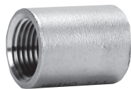
1/2" Coupling 1x