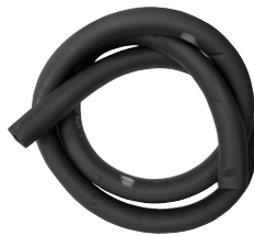
Hose Insulation x2