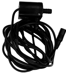
Submersible Conical Fermenter Cooling Pump