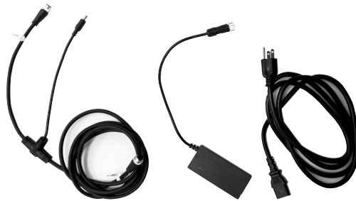
Power Adapter and T-connector