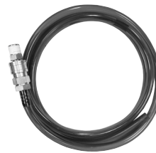
Blue Cooling Hose with Quick Connect Coupler with male disconnet