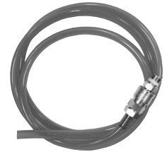
Red Return Hose with Quick Connect Coupler with male disconnet