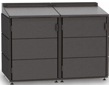
2-module standard-size CITIBIN trash enclosure, charcoal cladding, with planter.