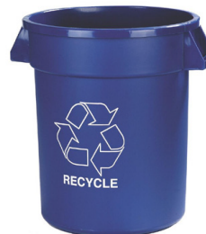
Standardized to fit Rubbermaid 23 gallon Slim Jim and 44 gallon brute.