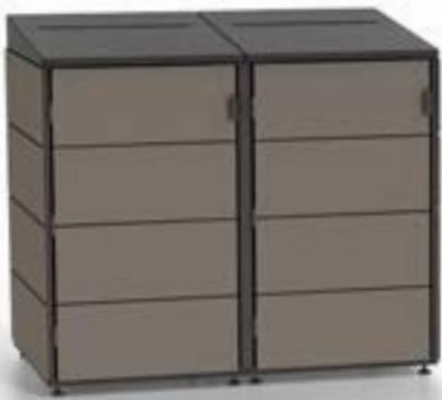
Example of a 2-module XL-size CITIBIN trash enclosure, coffee cladding, with sectional top door.