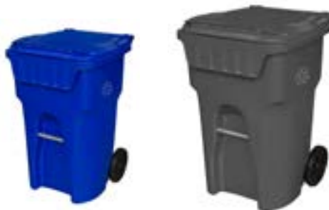
Perfect fit for most 65 to 95 gallon wheeled trash carts.