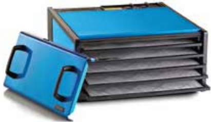
D500RB Radiant Blueberry