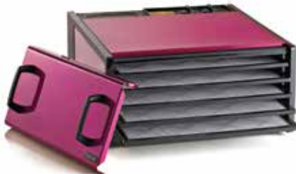
D500RR Radiant Raspberry