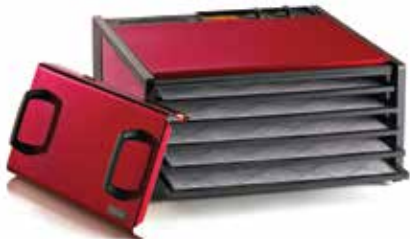
D500RC Radiant Cherry