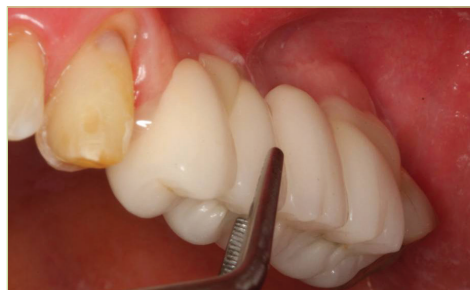
Fill internal surface of the restoration with DUO-LINK UNIVERSAL™ resin cement and immediately seat restoration.