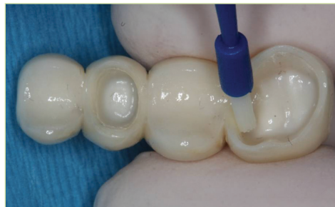
After cleaning internal surface with ZirClean™, apply a thin layer of Z-PRIME Plus to the zirconia bridge. Air dry for 3 to 5 seconds.