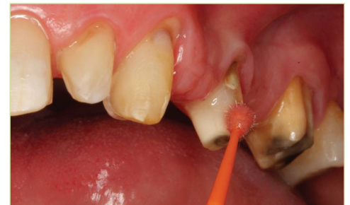
Apply two separate coats of ALL-BOND UNIVERSAL®, scrubbing the preparation with a microbrush for 10-15 seconds per coat. Do not light cure between coats.