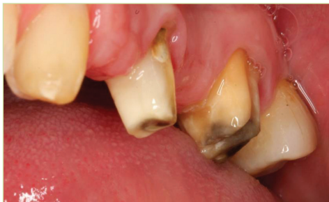
Prepared multiple-unit bridge.