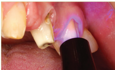
Air dry to remove solvent and light-cure for 10 seconds.