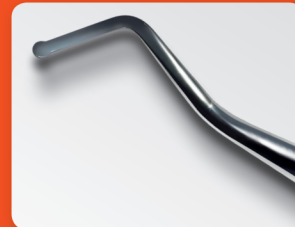
R-50 - Plain