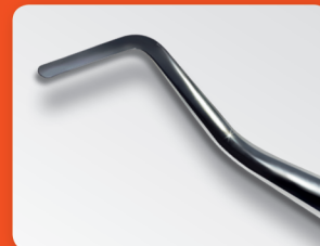
R-101 - Plain