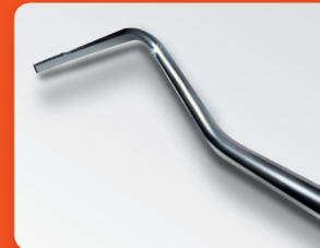
Guyer 7A - Serrated