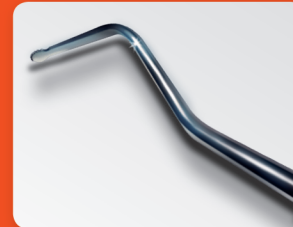
R-55A - Serrated