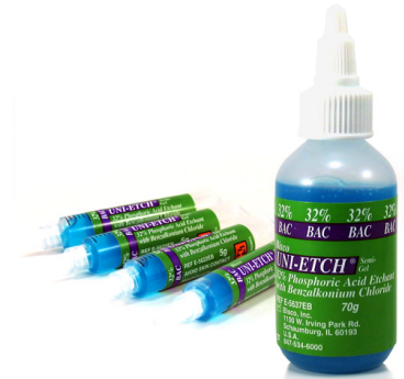
BISCO ETCHANTS Uni-Etch (32%), Etch37 (37%) Regular or w/BAC