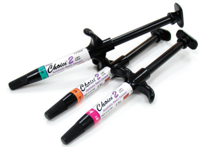
CHOICE 2 Aesthetic resin cement